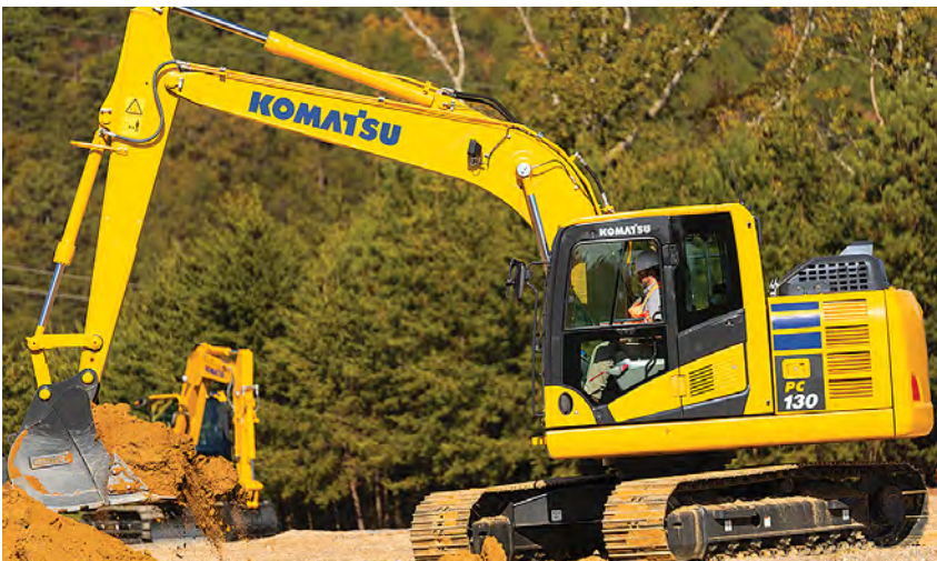
Earthmoving companies of all sizes appreciate a basic digging machine that's easily transported from job to job. They like it even better when the machine offers fast cycle times, deep digging capabilities and high production, such as the new 28,660-pound PC130-11.

Komatsu incorporated next-generation technology with considerable benefits to make its new WA475-10 wheel loader an ideal fit for quarry, waste, infrastructure, forestry and non-residential applications. Feedback received in the field guided improvements, which made it 30% more fuel efficient than its predecessor, leading to savings that can potentially make you more competitive and profitable.