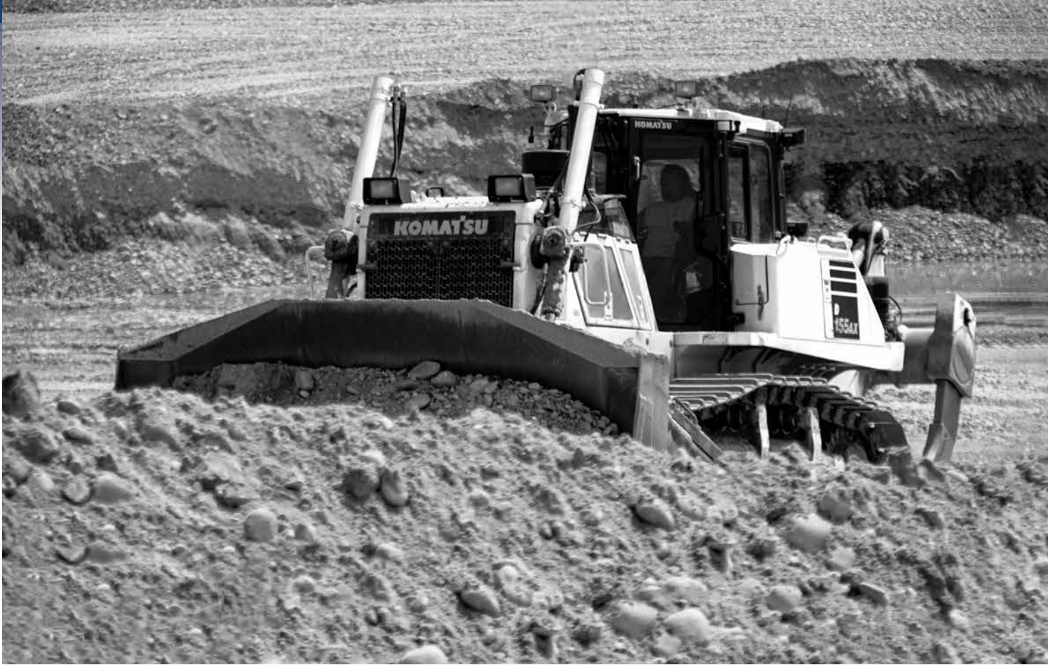
Komatsu works with its distributors on inventory management (based on machine population and other factors) to ensure that parts are available when needed.

owning and operating costs. For instance, overhaul programs for older machines offer scaled discounts, depending on how many components are rebuilt or replaced. That can be tied in with our Firm Future Order program, which enables machine owners to order major components several months in advance of their planned replacement. This locks in pricing at the time of the order and guarantees that genuine Komatsu parts are on-hand when the customer is ready to have the work completed.