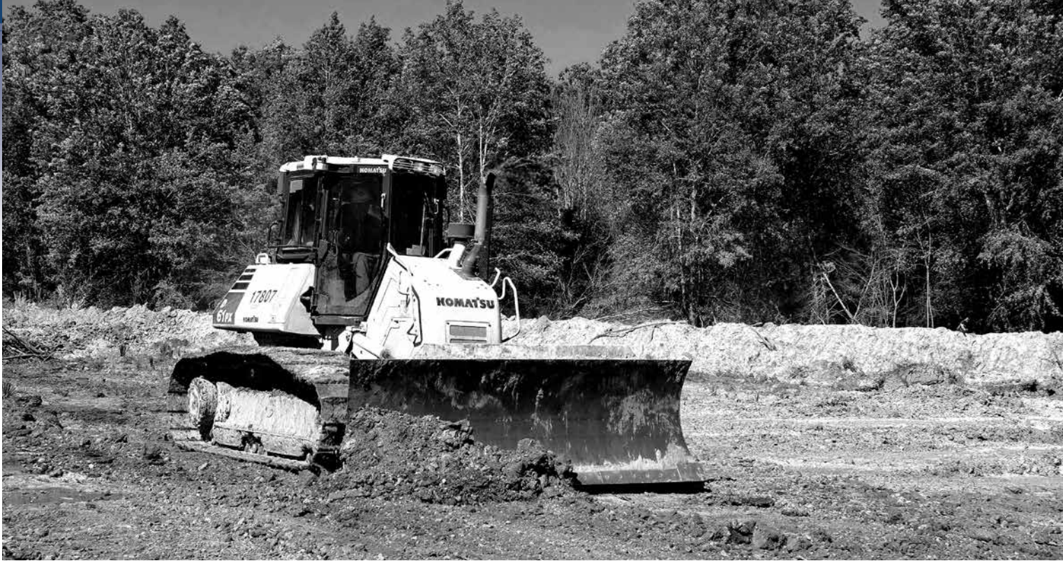
The Tax Cut and Jobs Act affects business expensing in a variety of ways, such as temporary full expensing for property currently eligible for bonus depreciation for five years. This applies to property placed in service after September 27, 2017, including new and used equipment.

being capitalized and depreciated – was permanently increased from $500,000 to $1 million with a $2.5 million phase-out and is indexed to inflation. The definition of property now includes roofs as well as HVAC, fire protection, alarm and security systems added to non-residential buildings already placed in service.