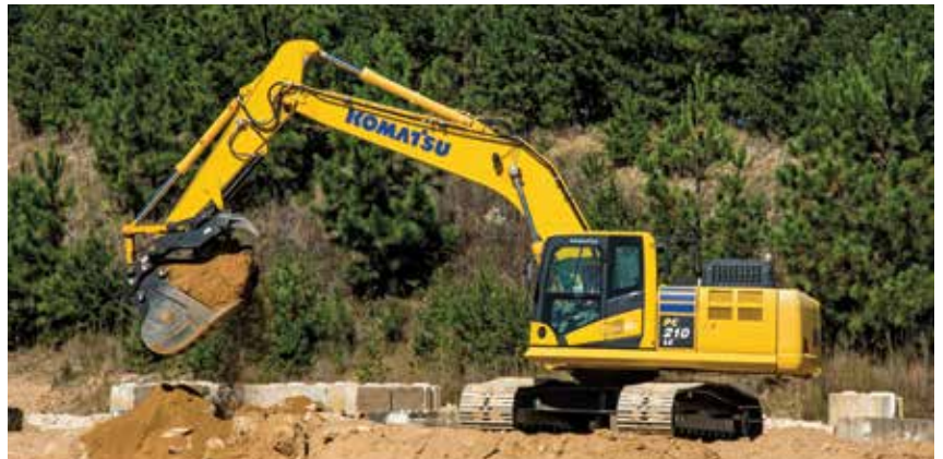
The 21-ton PC210LC-11 is the smallest excavator that Komatsu's Chattanooga Manufacturing Operation produces. The largest is the 49-ton PC490LC-11.

ANSWER: Absolutely, and the public as well! We have a lot of visitors come through every year. We want them to see how Komatsu machines are manufactured and the quality that's built in. ■