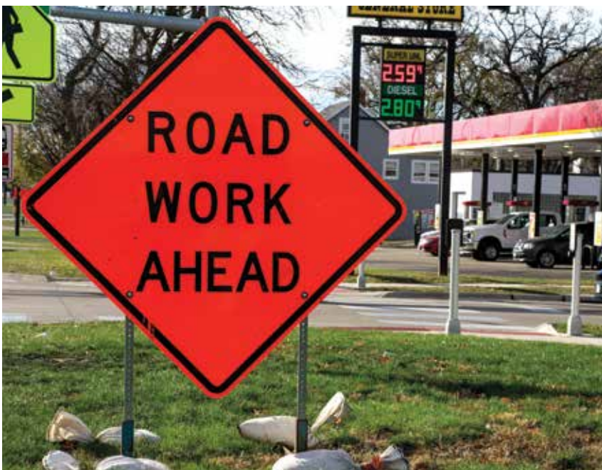
Recent polls show most Americans are willing to pay more at the pump, or in tolling, if it means better roads and bridges. “People are fed up,” stated former U.S. Transportation Secretary Ray LaHood in a Bloomberg article. “They’re ready for politicians to take action.”