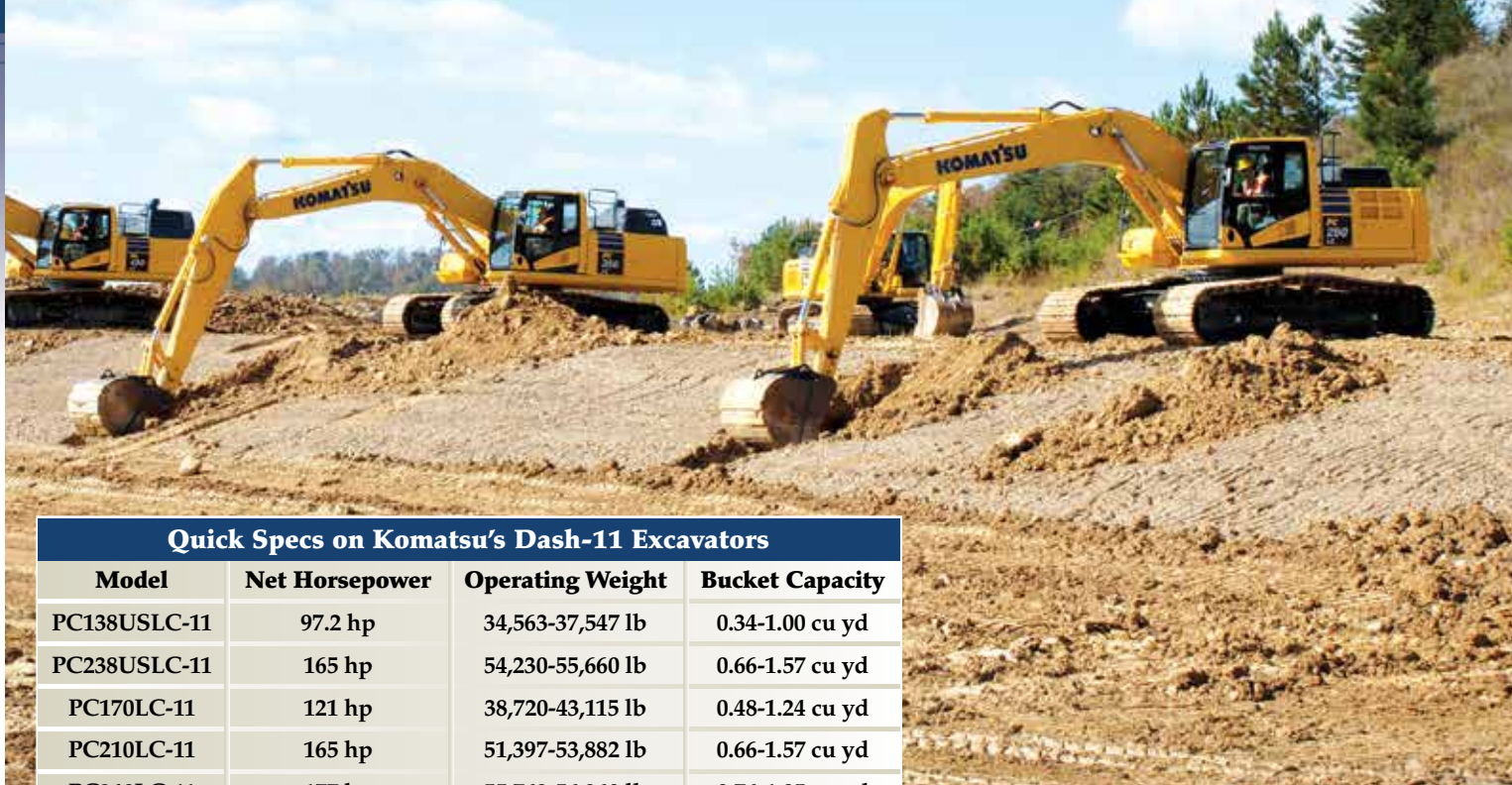
Quick Specs on Komatsu's Dash-11 Excavators