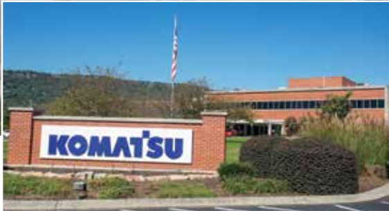
Komatsu's Chattanooga Manufacturing Operation builds standard excavators ranging from the PC210LC-11 to the PC490LC-11, as well as intelligent Machine Control PC360LCi-11 and PC490LCi-11 models. Additionally, it produces log loaders as well as tracked harvesters and feller bunchers for the forestry industry.

work closely with distributors and customers to ensure we are meeting their needs. There are other Komatsu factories around the world that build the same machines, and we coordinate with them. For instance, if they can't meet their current demand for some reason, CMO may ramp up to help and vice versa. As an example, when a tsunami hit Japan a few years ago, it devastated many areas of the country. Our Japanese excavator plant was occupied building machines to assist with the cleanup. That caused a spike in our production because, for a time, we had to build all the machines to supply North America.