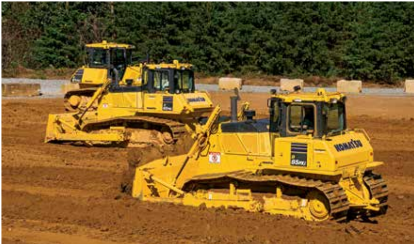
Attendees had the opportunity to operate Komatsu’s full family of intelligent Machine Control dozers at Demo Days.