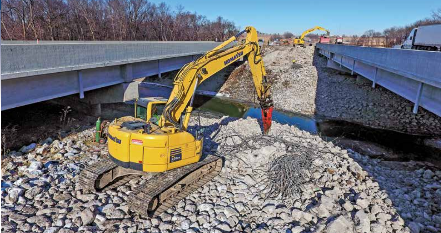
Public works spending, including highways and bridges, is expected to increase after falling last year. The American Road & Transportation Builders Association believes air terminals; public transit; Class 1 railroads; and private driveway, street and parking lot construction associated with residential and commercial developments will also be up in 2018.

the construction industry. Dodge Data & Analytics says it will rise 9 percent in dollars, corresponding to a 7 percent increase in units to 850,000. Dodge cites continued employment growth for easing caution by potential homebuyers as well as older millennials in their 30s helping to lift demand.