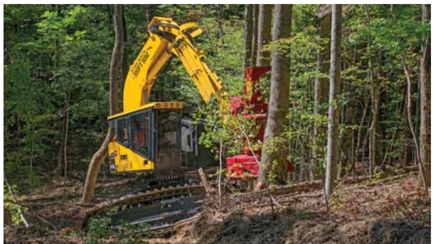
Four sizes of forestry-tracked harvesters and tracked feller bunchers are built at the Chattanooga Manufacturing Operation, including the XT460L-3.