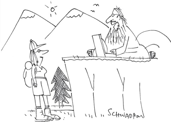
"Do you want the truth according to Google, Yahoo, Wikipedia . . .?"