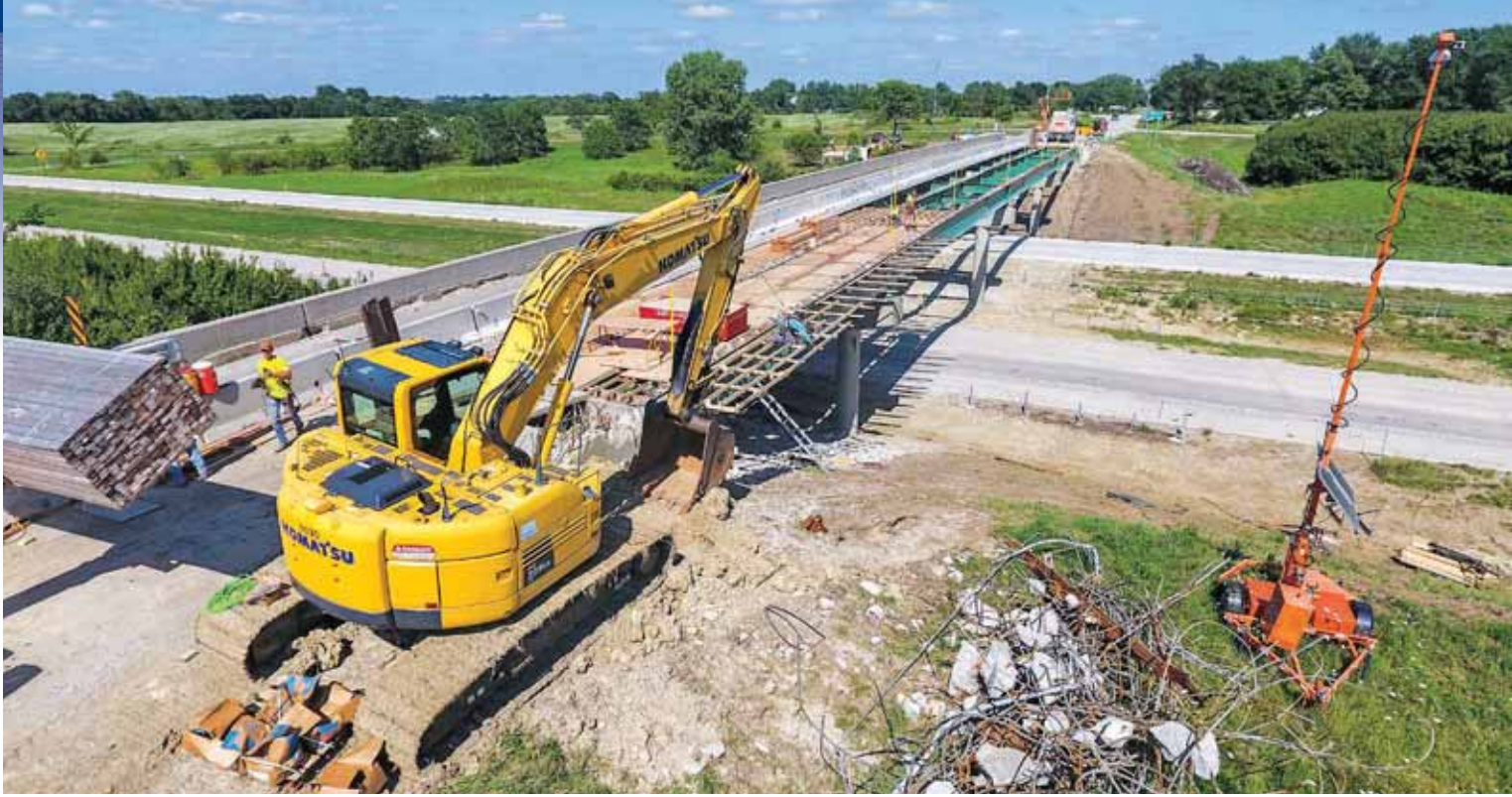
The Bureau of Labor Statistics on Occupational Outlook predicts the construction industry will need 1.7 million workers by 2020. With a national housing-market boom and more infrastructure projects getting the green light, construction companies are often unable to keep up with demand.

has shrunk the pool of qualified workers who can trade their caps and gowns for hard hats and steel toes upon graduation.