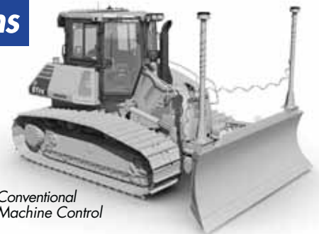
Conventional Machine Control