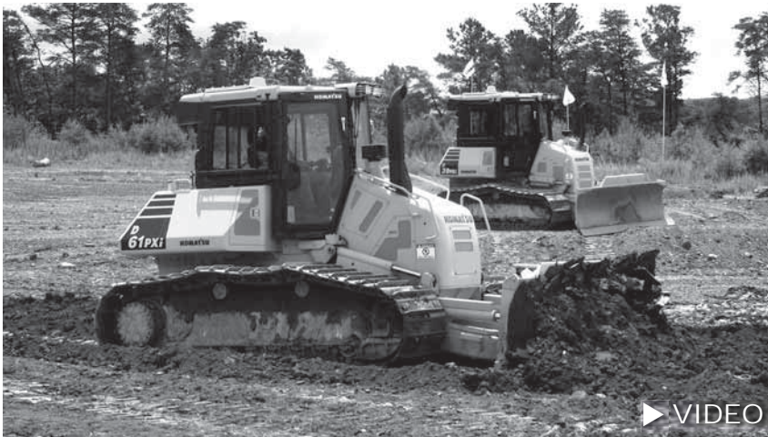
Komatsu showcased its intelligent Machine Control dozers, including D61PXi-23 and D39PXi-23 models, during an iMC experience at its Training & Demonstration Center in Cartersville, Ga.

Komatsu also highlighted the latest Topcon technology for productivity reporting and remote machine monitoring. Attendees could see the software that’s designed to work with GPS systems to track production in real time. ■