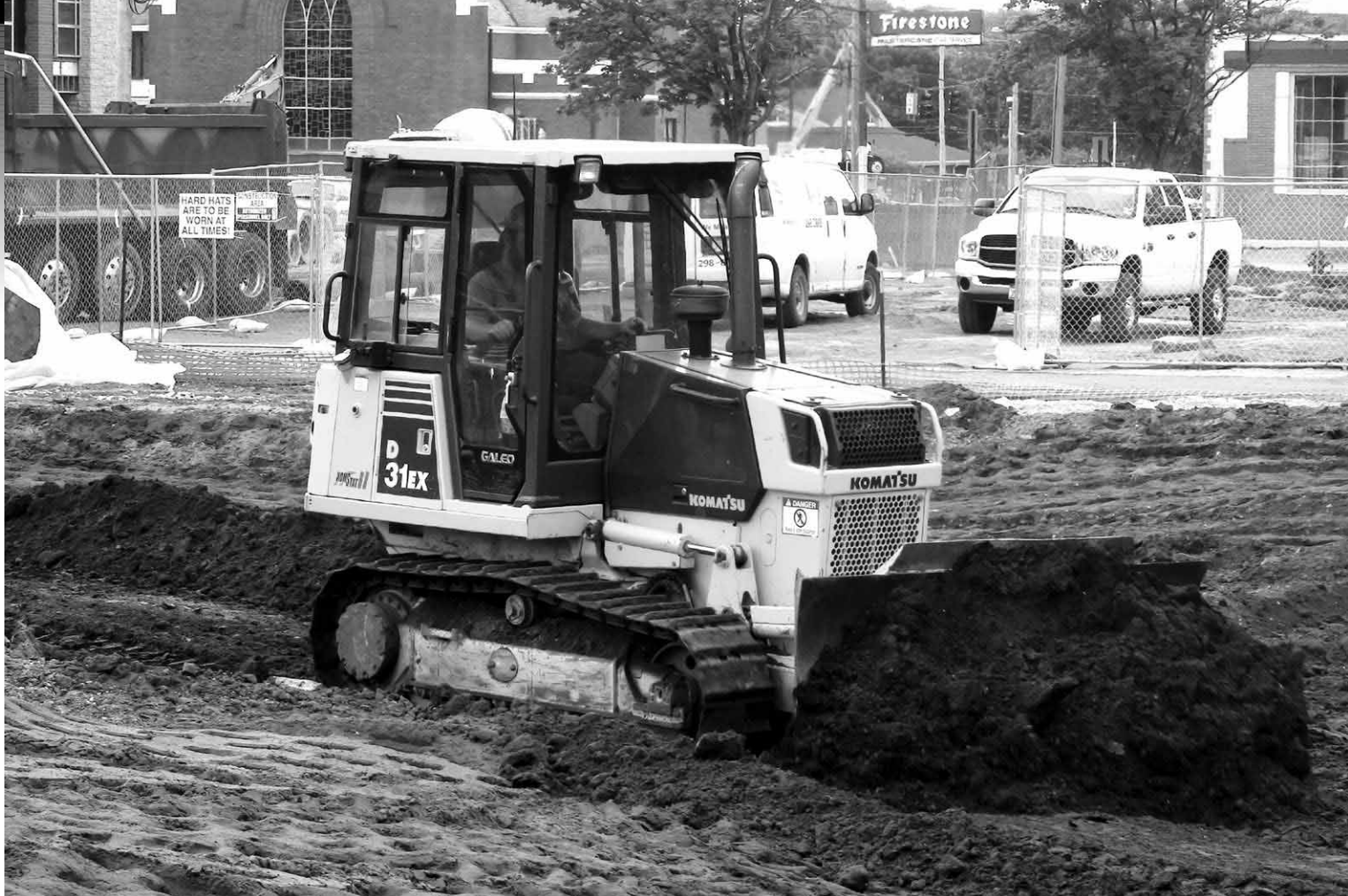
Construction spending hit a four-year high in July, according to a U.S. Census Bureau analysis. From July 2012 to July 2013, nearly $1 trillion was spent on construction, but with the growth comes a shortage of workers such as equipment operators.

A recent AGC report highlights the problem, showing about 75 percent of construction companies can't find the help they need. Nearly 700 businesses participated in the survey, which AGC conducted during the summer of 2013. Another report from the Construction Industry Roundtable estimates a shortage of approximately 2 million workers by 2017. This report also estimates that 17 percent of craft workers will retire during the next few years.