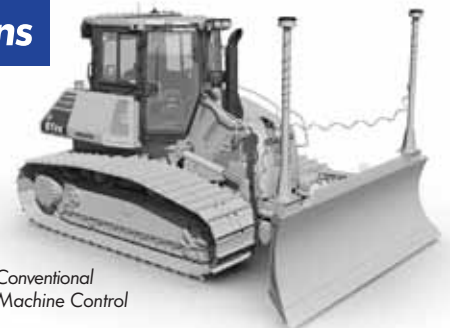
Conventional Machine Control