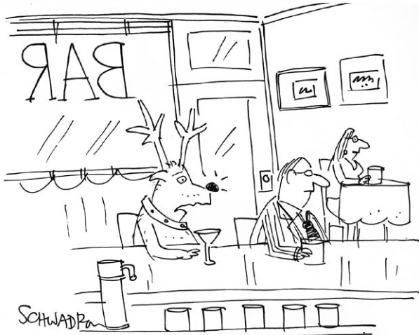
"Those were the good old days leading Santa's sleigh. Then along came GPS..."