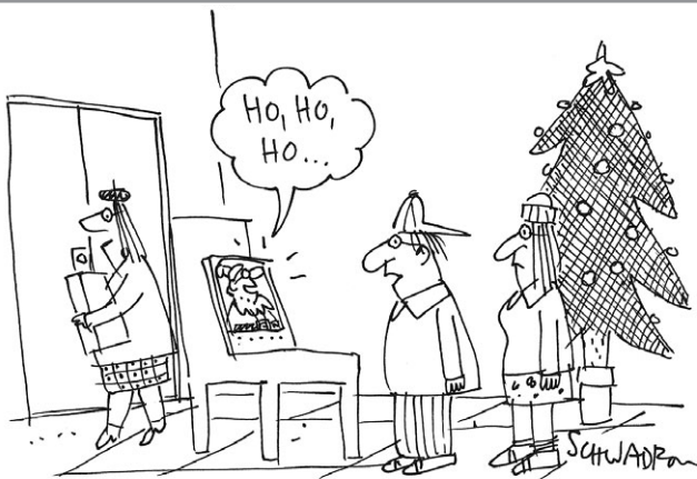
"Looks like Santa was replaced by a Santa app."