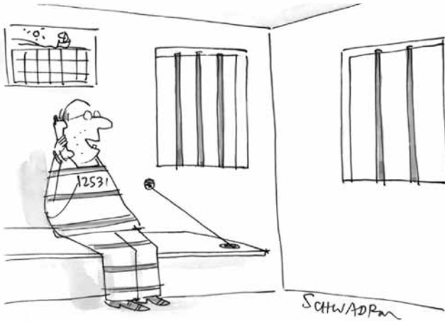
"Yes, I would like to take you up on your offer of easy-to-open replacement windows."