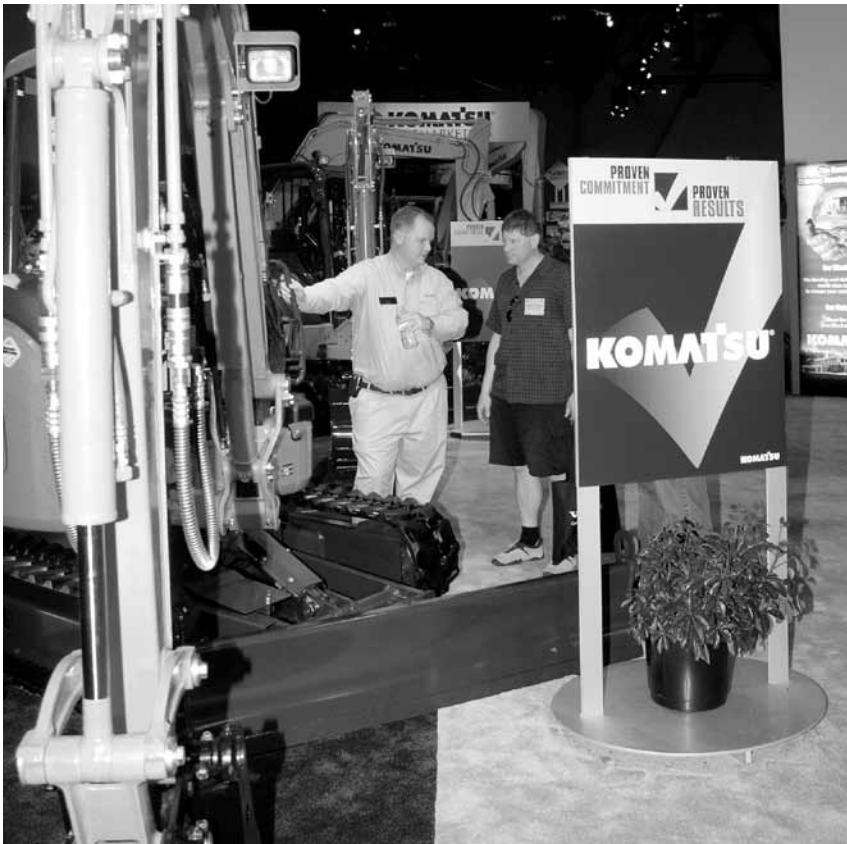
Product managers and other personnel will be on hand to provide information and answer questions about how Komatsu can help your business.

For more detailed information on the show, visit www.conexpoconagg.com . ■