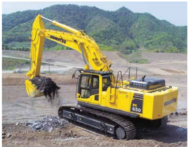
Significant improvements in comfort, control and performance make the new Komatsu PC650LC-8 a more productive excavator.