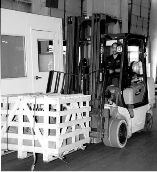
Larger parts are moved around the NMO using Komatsu fork lifts, which are also produced the plant.

shows that we're a facility focused on using environmentally sound practices.