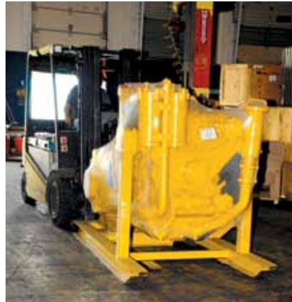
The Central Parts Operation carries thousands of items for Komatsu machines, from routine maintenance items to engines. It also carries remanufactured engine and transmission blocks and other large components.

Komatsu's Central Parts Operation is expanding with a 100,000-square-foot addition that's designed to improve efficiency. The CPO handles parts for Komatsu's construction, mining and utility equipment around the world, including both new and remanufactured components.