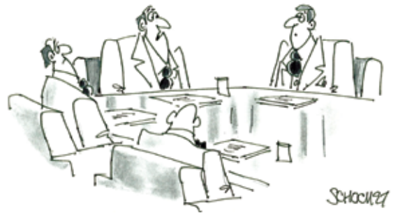
"Really? I wasn't aware of that!"

"I gave up smoking. My doctor said it was a health risk."