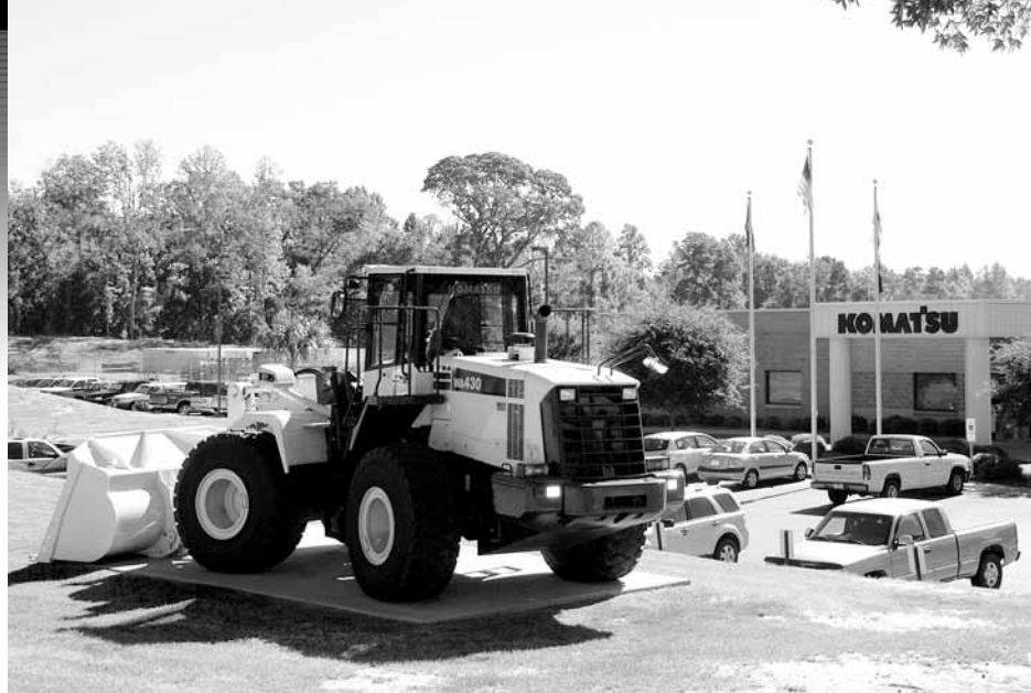
Komatsu's Newberry Manufacturing Operation produces six wheel-loader models, ranging from the 170-horsepower WA320-6 to the 350-horsepower WA500-6, as well as fork lifts.

The plant is 250,000 square feet of building sitting on 80 acres of land, and was built with future expansion in mind. I'm sure at some point that will be a consideration. ■