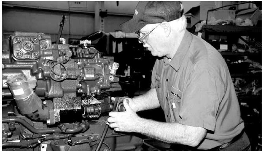
Subassemblies are part of the NMO's operations, including putting together engines before they're installed on the machines.