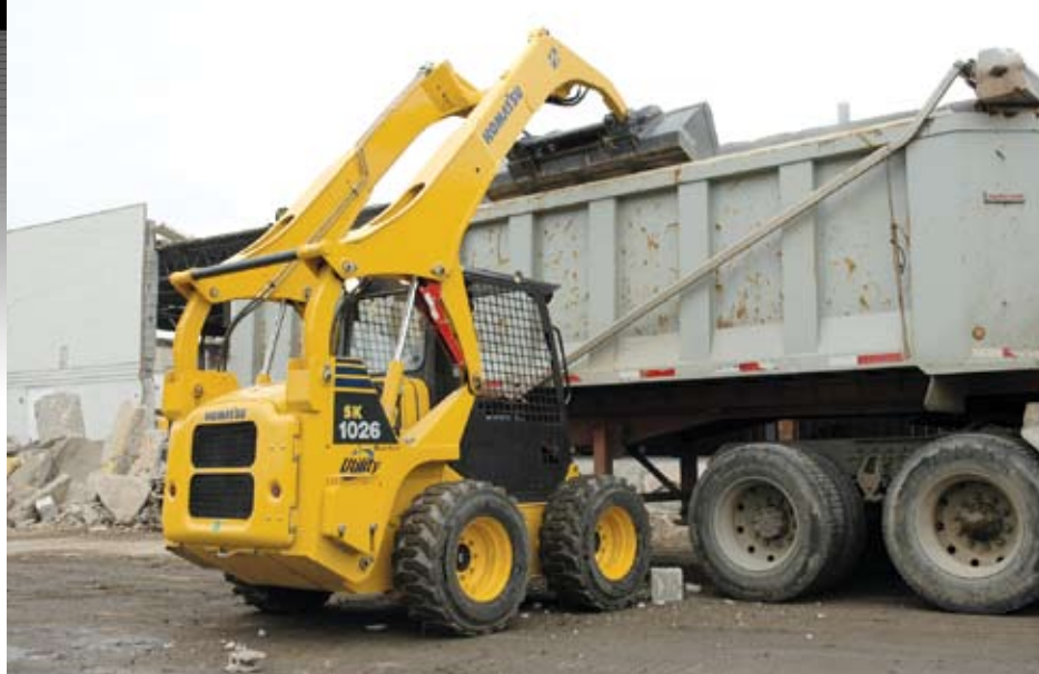
Komatsu's Newberry, S.C., manufacturing facility is the worldwide development center for skid steer loaders. Komatsu will introduce its next-generation, Tier 3-compliant skid steers later this year.

ANSWER: Like much of Komatsu's larger construction equipment, utility machines