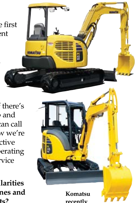
Komatsu recently introduced its new MR-3 series of compact excavators. The units are packed with features that offer better productivity and operator comfort.

ANSWER: Customers will find that even though we're a relatively new player in the utility market, our smaller machines are just as reliable and productive as Komatsu's larger models. No matter what size the machine, the same Komatsu development and testing process is applied. Whether a skid steer loader or 40-ton excavator, the process is the same. There's also a high degree of component commonality and Komatsu is known for its in-house hydraulic systems. That means customers will get the same quality and reliability from our smallest PC09 excavator as they will with our largest mining machine. It's part of Komatsu's commitment to quality equipment, product support, parts and service throughout its entire lineup. ■