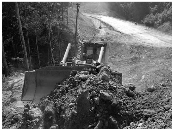
Public construction, such as road building (left), and commercial construction (above) continued to show growth in 2007 with solid increases expected to continue this year as well.

Underscoring the idea that housing is more of a local and regional problem than it is a national one, NAHB reports that a majority of markets (200 of 363) continue to experience "modest and sustainable" appreciation in house values, adding, "The fallout from irresponsible subprime ARM lending will not include deep, nationwide house price declines."