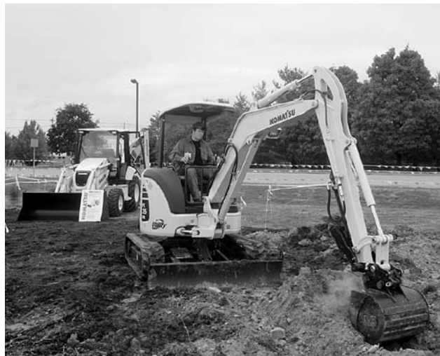
ICUEE attendees had the chance to try the latest in utility equipment, including Komatsu's PC35MR-2 excavator.

Komatsu's display area included a variety of machines such as compact track loaders, skid steer loaders, excavators and backhoe loaders.