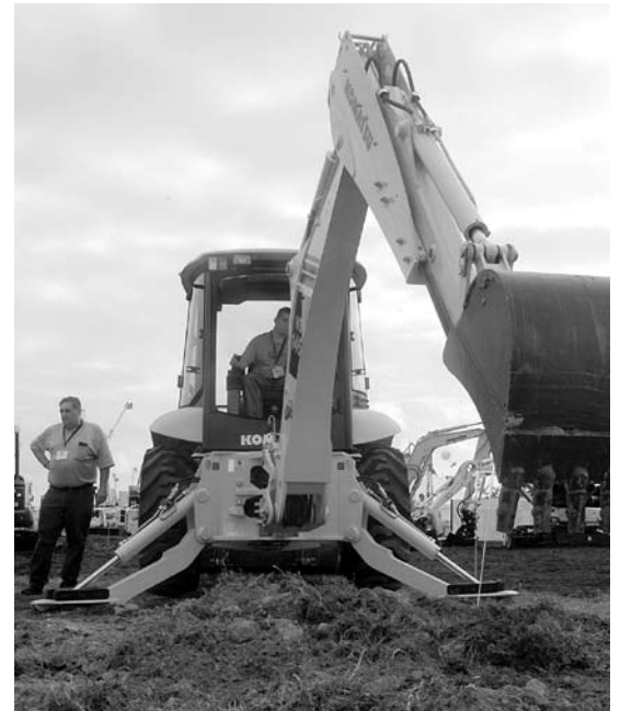
One of the benefits of ICUEE is the opportunity for attendees to demonstrate equipment, such as Komatsu's WB146-5 backhoe loader. Also available at the show was the WB146PS-5, which features power shift.