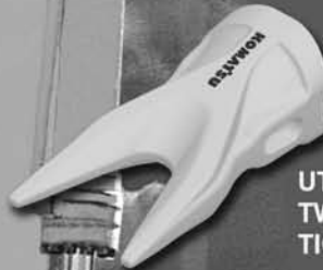
UT TWIN TIGER