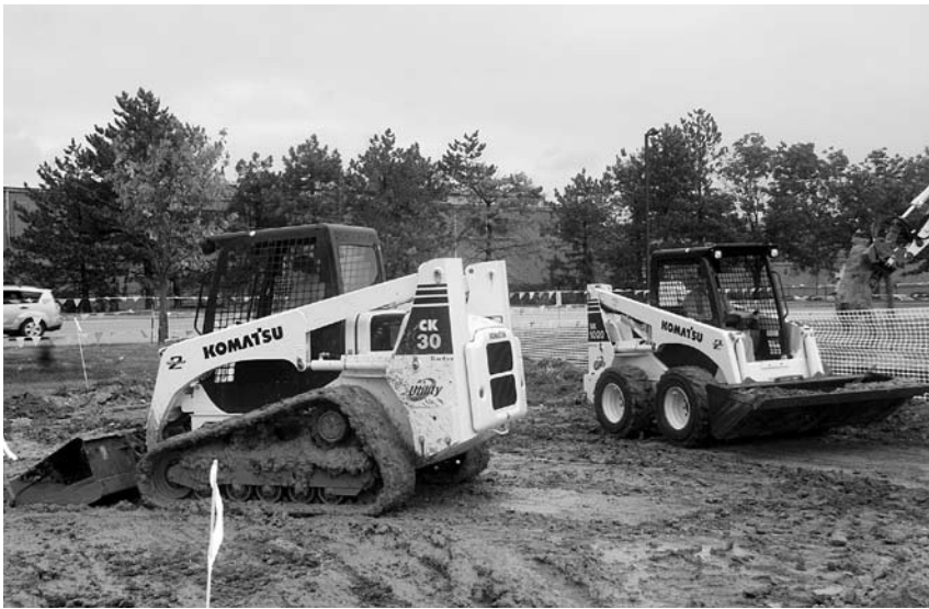
Following heavy rains, Komatsu product managers demonstrated the benefits of Komatsu's skid steer and compact track loaders by moving dirt in the display area.

to tilt up the ROPS structure as well. Now they have full access to the hydraulic components, the swing motor and the backside of the engine where the alternator and starter are located."