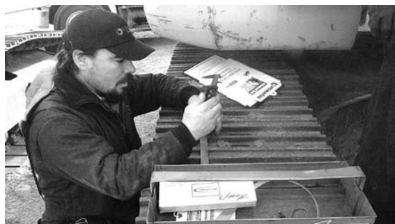
(Left) Following about five hours of classroom training, technicians are critiqued on their practice evaluations.

For more information on Komatsu Distributor Certified used equipment, call our sales office today.