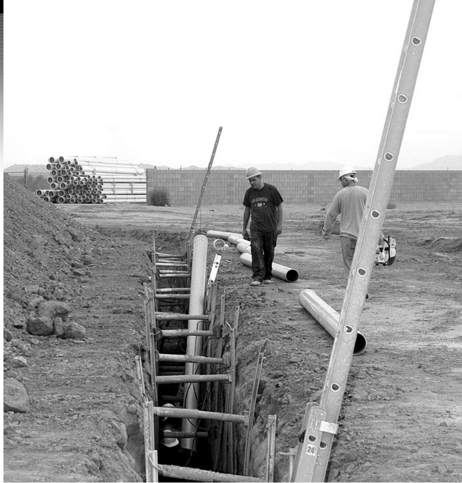
Underground contractors know good practices in trench safety are extremely important, including trench shields or boxes for deep excavations, ladders for egress at proper intervals and hard hats and other safety gear to keep workers protected from potential falling objects.

Once the program is in place, make sure everyone understands the full scope of it. While it may seem unproductive, hold a meeting or series of meetings with everyone in the company to make sure each person has a copy of the program and understands its contents. The time