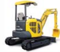
COMPACT HYDRAULIC EXCAVATORS Ten Models Dig Depth, 4'11" - 13'8"