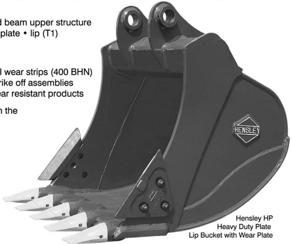
Hensley HP Heavy Duty Plate Lip Bucket with Wear Plate

The HP series buckets are available with the all new KMAX system .