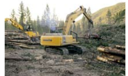
Compact equipment, such as skid steer loaders (above left) and specialty equipment, such as logging machines through Komatsu Forest, are now part of the large Komatsu family of machines.

would stop at jobsites and stare at it," said Grzelak. "Today, tight-tail-swing machines are a staple of many contractors' fleets."