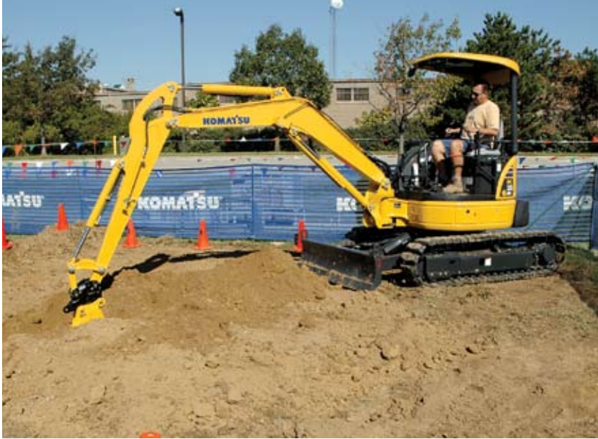
This attendee tried out the Komatsu PC35MR-2 compact hydraulic excavator at the ICUEE show.