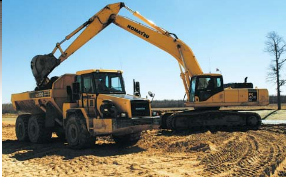
As the excavator/articulated dump truck combination gained widespread acceptance in the last decade or so as a cost-effective method of moving dirt, Komatsu introduced a highly regarded line of articulated haulers.

"When Komatsu came out with the first tight-tail-swing machine in the mid- to late '90s, the old PC128UU that was painted purple, people