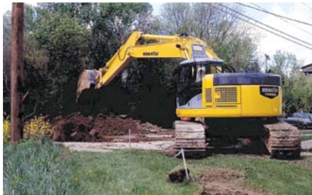
A leader in tight-tail-swing excavators, Komatsu offers nine compact models and construction-size units, including the PC308USLC-3, the industry's largest tight-tail-swing machine.