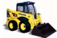
SKID STEER LOADERS Six Models Operating Capacity, 1,350 - 2,850 lbs.