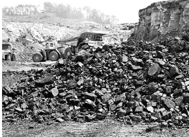
Both mining and logging should do well in 2006, however, there will likely continue to be a shortage of some large equipment, so if you anticipate needing a mining machine or large truck, forecasters recommend ordering early.

Yes, there is a housing bubble, but it is concentrated in the very hottest housing