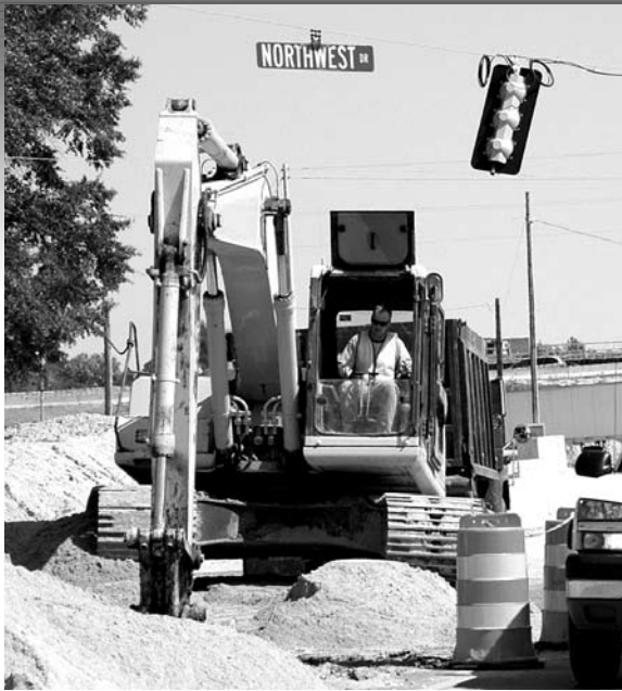
The highway bill Congress passed last year will spur road-related construction activity.