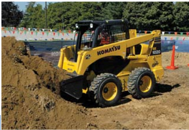
The SK1020 skid steer loader (right) and WB140 backhoe loader (below) were two machines Komatsu had available for demonstration at the event.