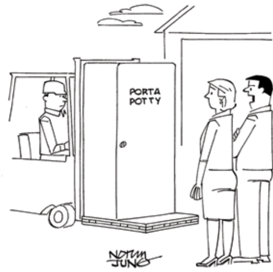
"WELL, HE DID SAY HE COULD REMODEL OUR BATHROOM IN LESS THAN A DAY."