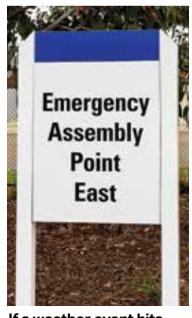
If a weather event hits your business during work hours, there should be designated areas for workers to report to.