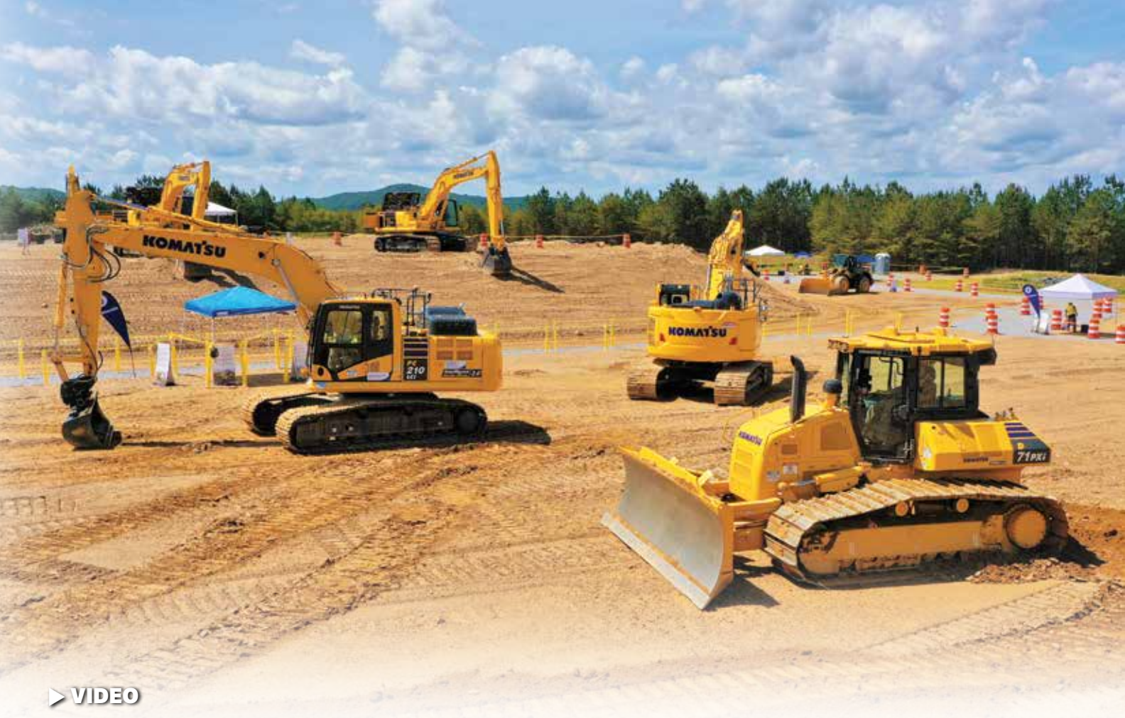
During Demo Days, attendees could operate more than 20 machines, including the popular D71PXi-24 iMC 2.0 dozer, a PC210LCi-11 iMC 2.0 excavator with tilt bucket control, and a PC238USLC-11 excavator with a Smart Construction Retrofit kit.

Komatsu Smart Construction solutions managers were on hand to answer questions and provide information about Smart Construction solutions, including the upcoming Smart Construction Office.