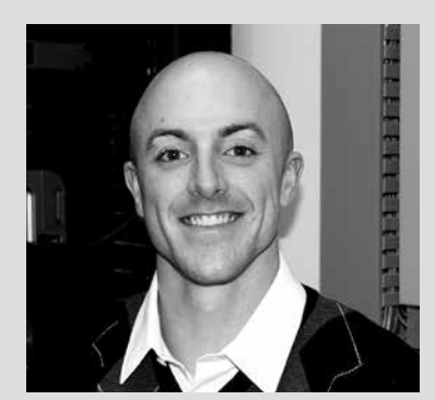
This is one of a series of articles based on interviews with key people at Komatsu discussing the company's commitment to its customers in the construction and mining industries – and their visions for the future.

ANSWER: We manufacture seven of the largest electric-drive mining trucks in the