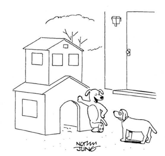
"My owner is a contractor specializing in new home construction!"