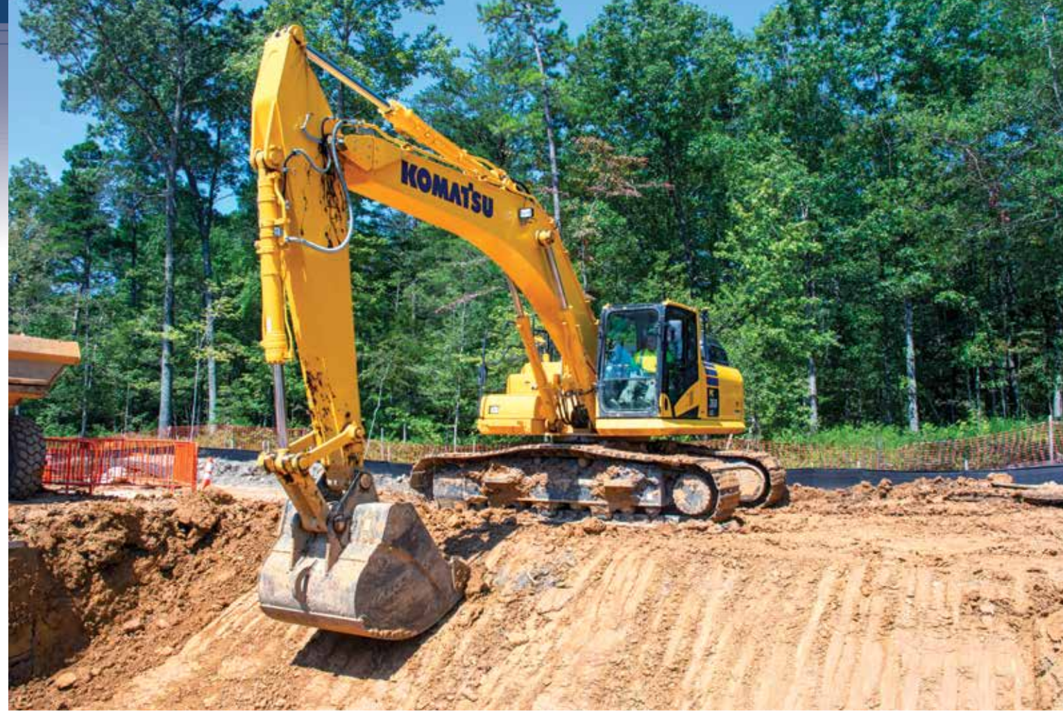
Komatsu intelligent Machine Control excavators, including this PC360LCi-11, are go-to machines for Liesfeld Contractor, which puts them to work excavating, digging trenches and constructing ponds. "They have the versatility to move mass quantities of materials as well as do precision work such as slopes, so we were able to construct a relatively large pond rather quickly," said Technology/GPS Manager Chris Ashby.

site model is loaded into a machine, we set up a base station and a benchmark, and that's it. We have noticed the biggest savings with fine grading. This technology allows us to do (finish grading) three to four times faster than before we acquired the first intelligent Machine Control dozer."