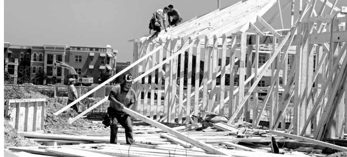
A recent analysis by Associated General Contractors of America showed hourly earnings in the construction industry averaged $29.63, an increase of 3.5 percent from a year earlier. That's attracting some workers back to the industry, but the market remains tight.