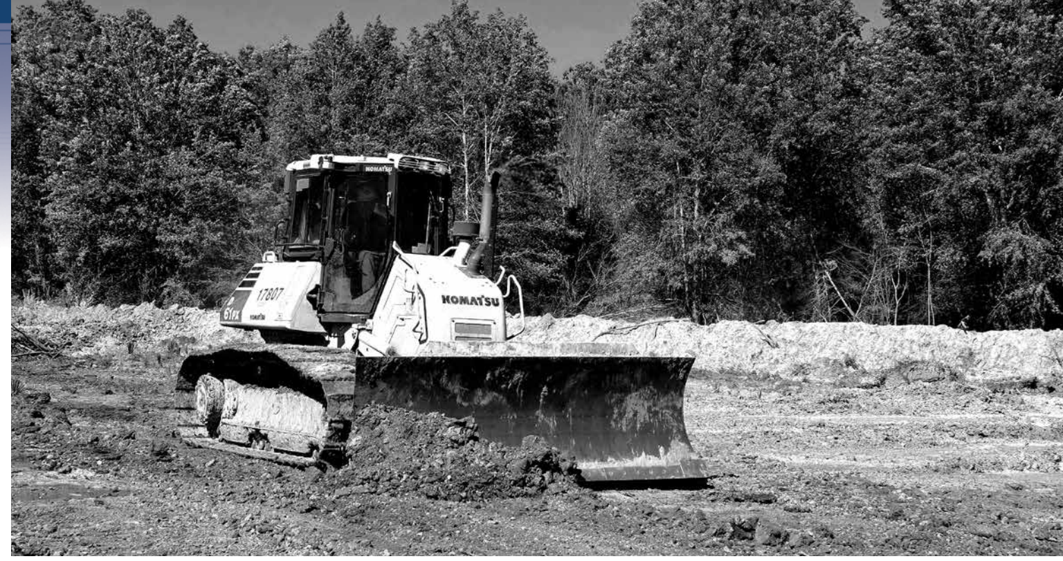
The Tax Cut and Jobs Act affects business expensing in a variety of ways, such as temporary full expensing for property currently eligible for bonus depreciation for five years. This applies to property placed in service after September 27, 2017, including new and used equipment.

being capitalized and depreciated – was permanently increased from $500,000 to $1 million with a $2.5 million phase-out and is indexed to inflation. The definition of property now includes roofs as well as HVAC, fire protection, alarm and security systems added to non-residential buildings already placed in service.