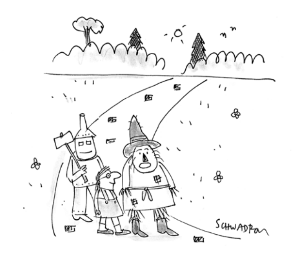
"Why do I need a brain when I can just Google everything?"