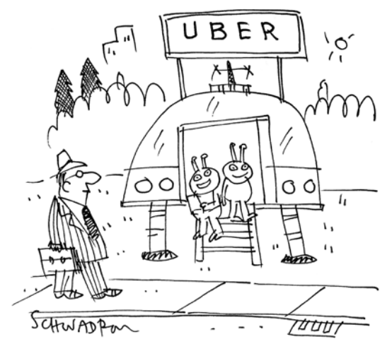
"Space exploration has gotten easier now!