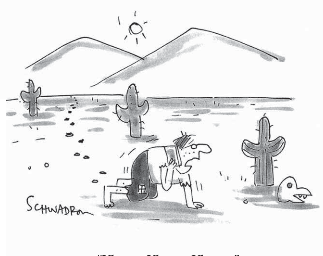
"Uber ... Uber ... "