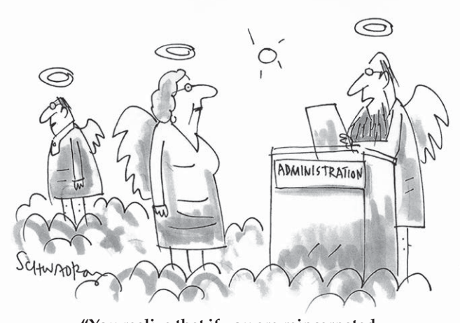
"You realize that if you are reincarnated, you'll need to learn all new passwords?"