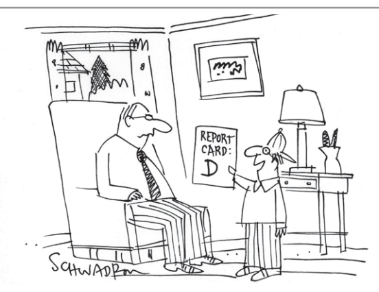
"But Dad, this will make sure I don't get saddled with college debt."