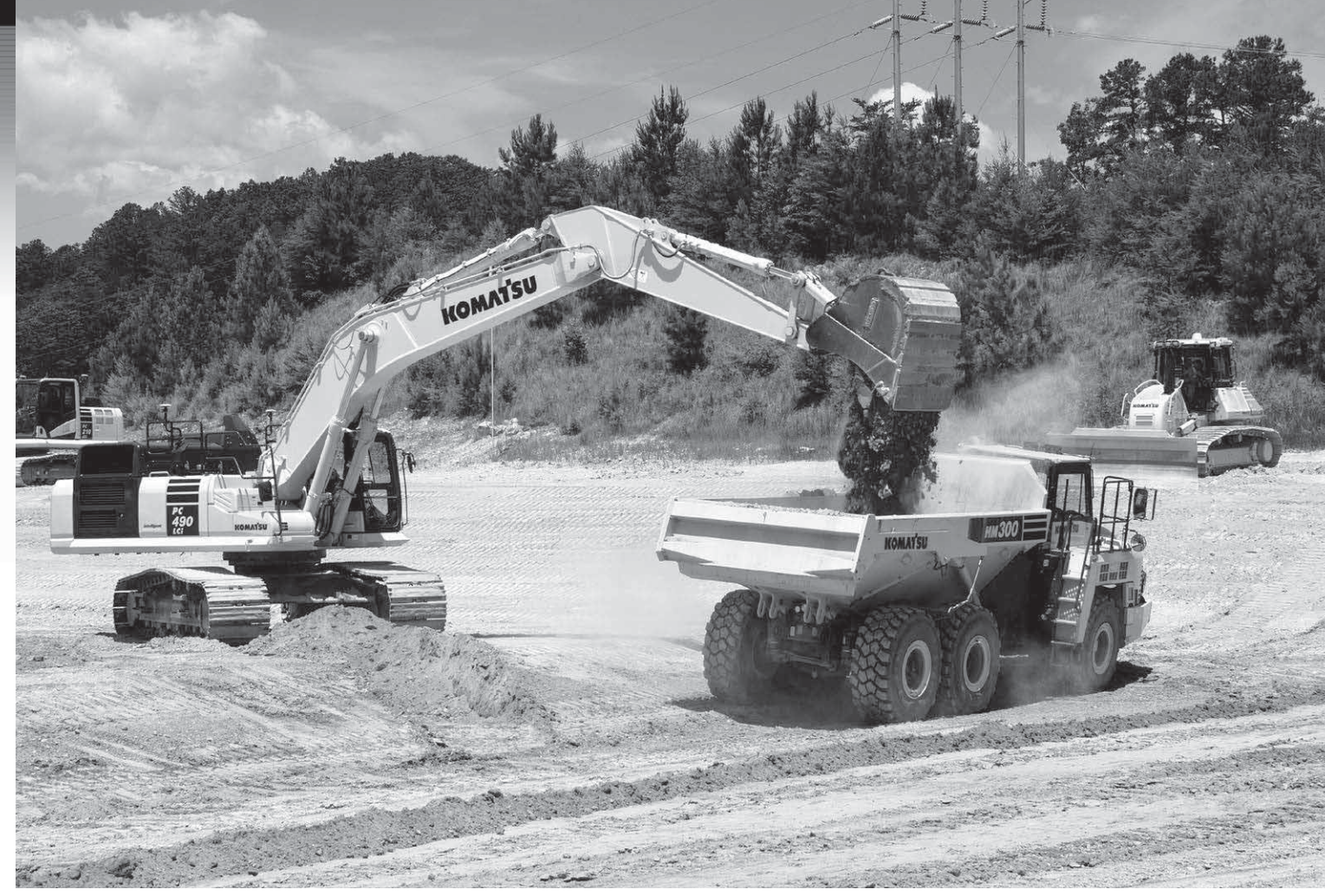
Komatsu will prominently display its intelligent Machine Control dozers and excavators, including the PC490LCi-11, in the outdoor Gold Lot (Booth G4183). There, it will also highlight its SMARTCONSTRUCTION program, which goes beyond intelligent Machine Control equipment with comprehensive jobsite solutions.

CONEXPO-CON/AGG brings the Imagine What's Next theme and technology focus to life with a new 75,000-square-foot Tech Experience pavilion dedicated entirely to presenting emerging construction innovations that are driving change and process improvements across the industry. Located in Silver Lot 3, it will feature items such as wearables for health, safety and productivity; the latest skills for careers; and new materials to enhance the nation's infrastructure, according to the Associated Equipment Manufacturers (AEM), the lead sponsor of the show.