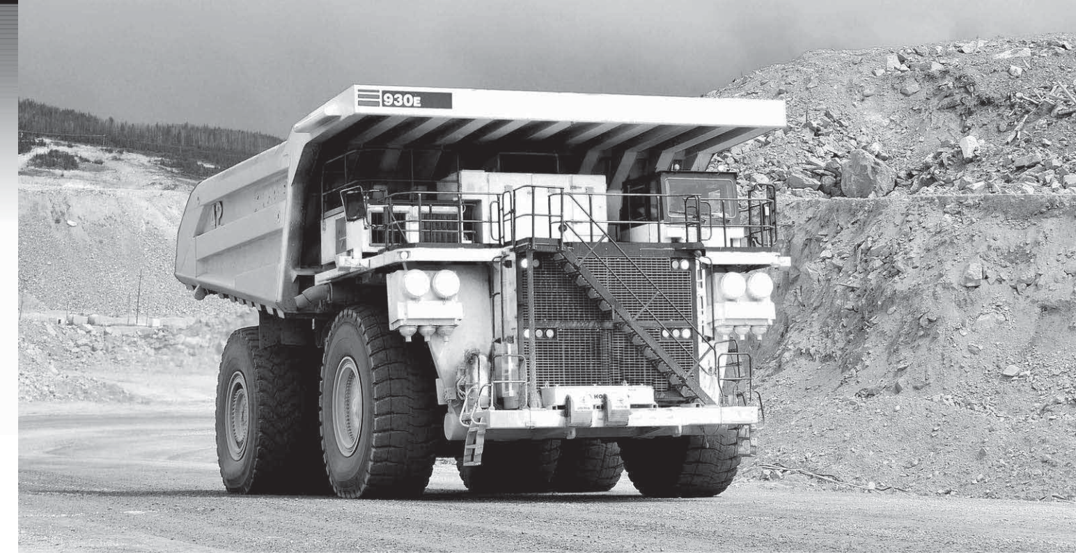
Komatsu's Peoria Manufacturing Operation designs and builds 100-ton to 400-ton trucks, including the popular 930E.