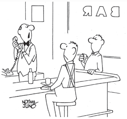
"Did you bring your hard hat? Your wife says you'll need it when you get home."