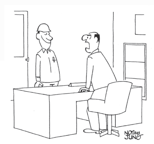
"... and another thing – remove your ear plugs when I'm talking to you!"