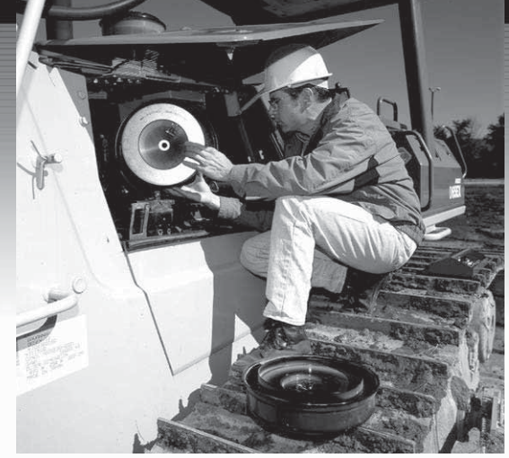
To accommodate customers' changing attitudes regarding machine ownership, Komatsu offers new programs that encourage customers to meet with distributors and plan future maintenance. The programs ensure that Komatsu-certified technicians continue to perform maintenance on machines.

reward the Komatsu machine owner with the component assurance and core guarantee; both of which are fully transferrable when it's time to trade in or sell the machine. Our Komatsu distributors use KOMTRAX to monitor the machine and proactively schedule and perform maintenance at times that work best for the Komatsu machine owner. Factory-trained technicians perform the work, and all services include oil analysis of each component and a full machine inspection. This complete service history also ensures that the machine qualifies as Komatsu CARE Certified Equipment, our highest level of previously owned equipment and a serious driver of higher residual values when an owner decides to trade in or sell the machine.