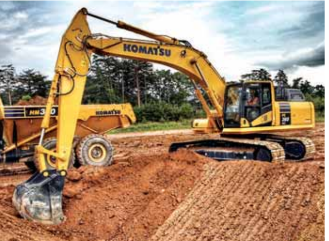
The new intelligent Machine Control excavators feature Komatsu's fully factory-integrated machine-control system. The exclusive control function lets operators focus on moving materials efficiently, without worrying about digging too deep or damaging the target surface.