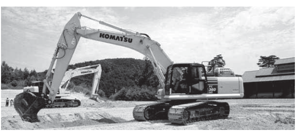
Among the machines featured was the popular 30-ton class size PC360LCi-11.

Komatsu introduced its first intelligent Machine Control products three years ago with the D61i-23