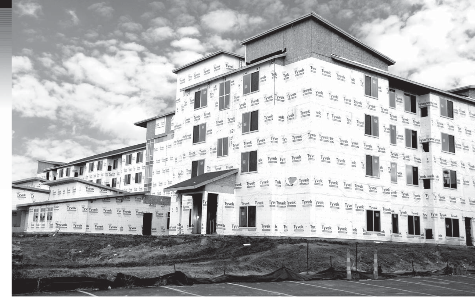
Commercial construction could see a 15-percent rise, with the hotel market especially strong. According to the Architectural Building Index, near-term activity overall is at its highest level in several years.