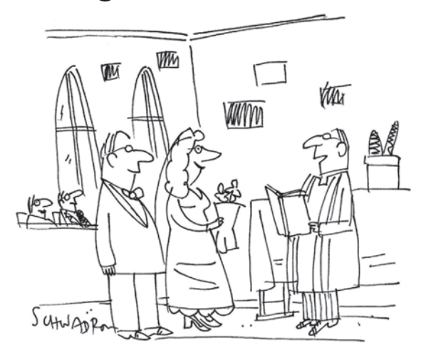
"Will thou love her, cherish her and put her on our affordable health plan?"