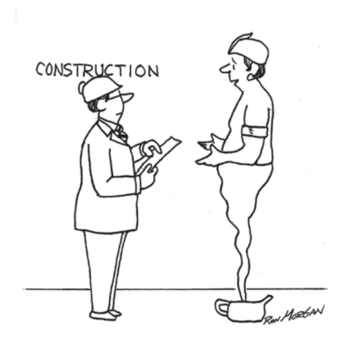
"Sorry, but I can't make any promises on any wishes that have anything to do with the government."

1. I T E S __ I ____ 2. W R E P O __ W ___ 3. L A D E R E D __ ____ 4. L I R U D E B B __ ____ R 5. R N O T E C E C __ C _____