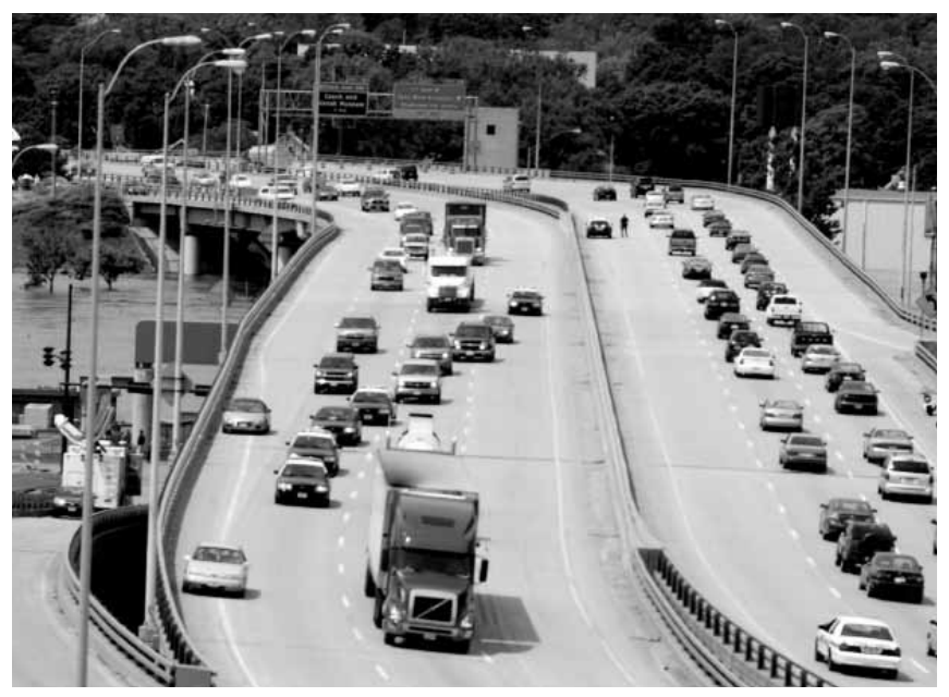
Today's Interstates and other highways are vast improvements over the Lincoln Highway and other early roads designed for automobiles. Passed in 1956, the Dwight D. Eisenhower National System of Interstate and Defense Highways turns 57 this year.

Today, annual spending on road construction is in the billions. The latest highway bill, MAP-21 (Moving Ahead for Progress in the