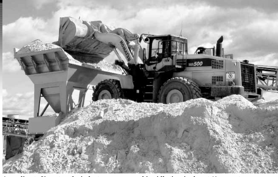
According to Komatsu, the industry average machine idle time is almost 40 percent. Cutting idling time can extend the productive life of a machine by eliminating unnecessary hours and reducing wear and tear. Fuel savings and lower emissions are other benefits.

Like the participants in the No Idle Initiative, other Komatsu users with Tier 3 and Tier 4