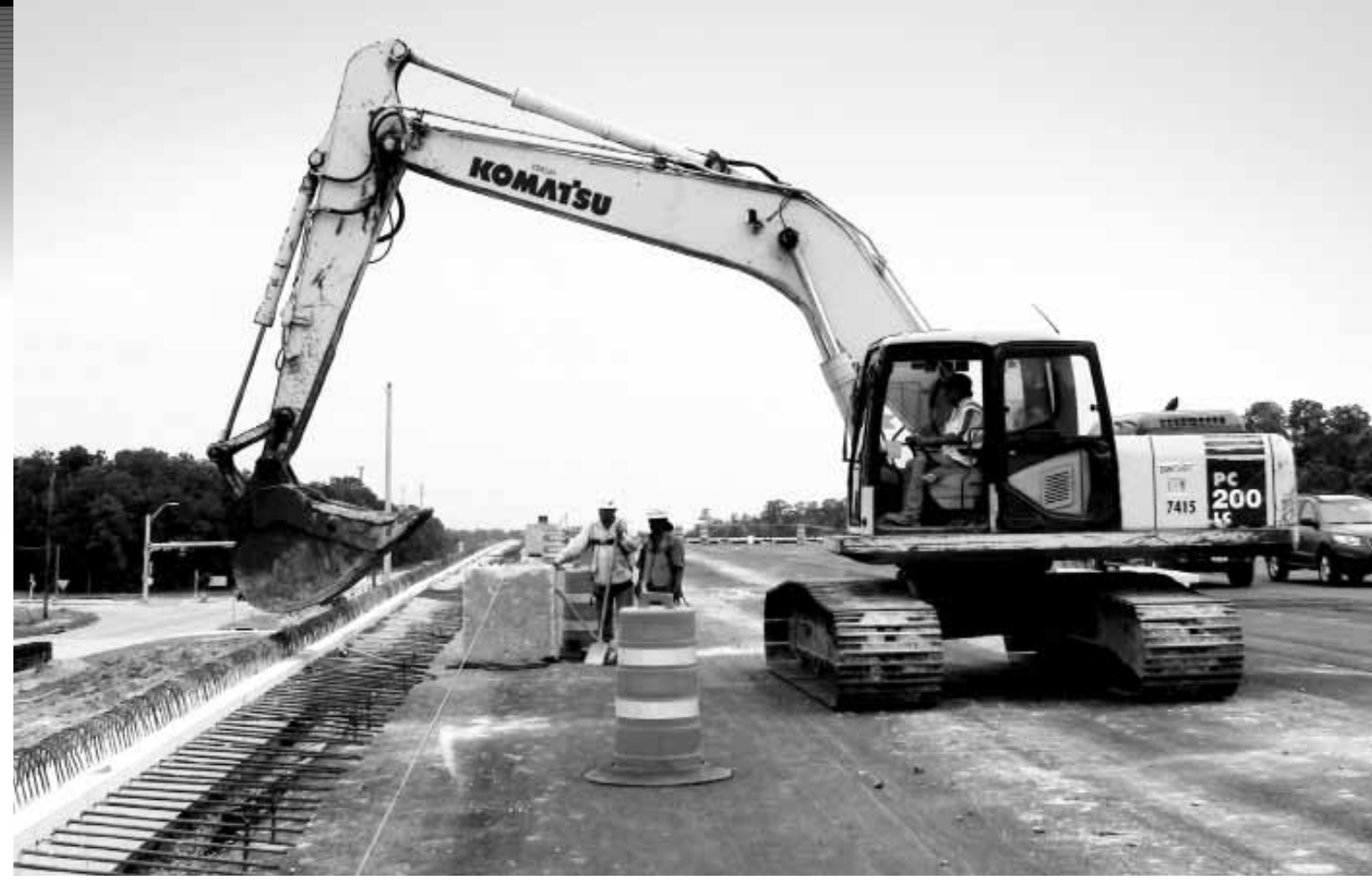
The nation's Federal Highway Program turned 100 last year, and the U.S. continues to work to rehab, rebuild and construct new roads. Today's annual spending on such projects is near what the entire Interstate system cost to build.

of the nation's Interstate highway system that covers more than 46,000 miles. Not long after the Lincoln Highway was established, a Lt. Col. named Dwight Eisenhower set off west from Washington, D.C., as part of the Army Transcontinental Motor Convoy in 1919. It connected with the Lincoln Highway in, of all places, Gettysburg, Pa., in July.