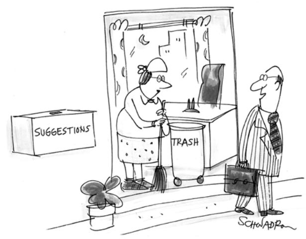
"Don't forget to empty the suggestion box."