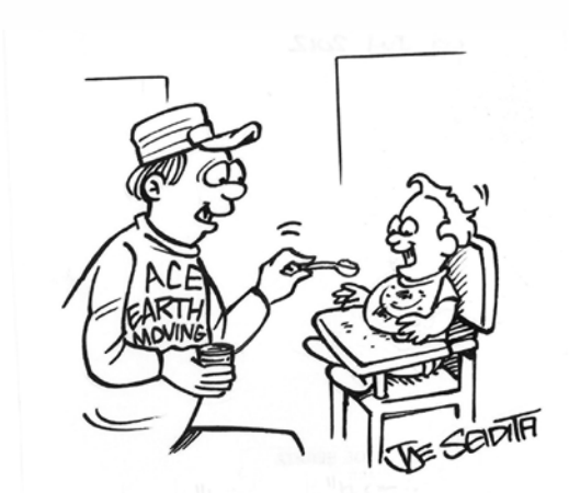
""Here comes another load of soil for the dump truck."