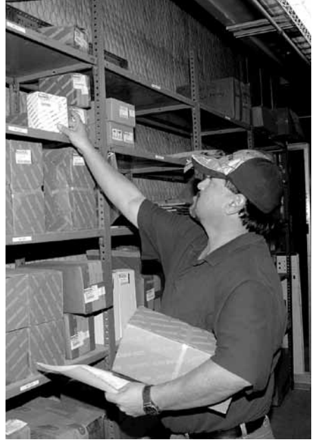
Komatsu's fill rate is nearly 99 percent in terms of immediate or next-day availability through its distributors and regional parts centers.

We believe that using OEM parts and fluids is ultimately more cost-effective than using will-fit components or fluids that may not provide maximum performance, or worse, lead to a catastrophic failure.