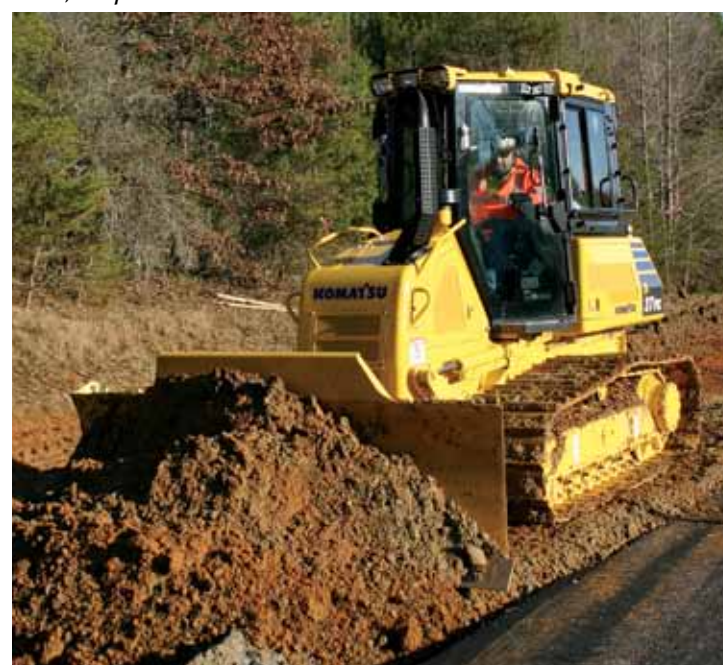
New engine technology in the Komatsu D37-23 and D39-23 dozers improves efficiency and lowers fuel consumption, compared to Tier 3 models, while maintaining horsepower.