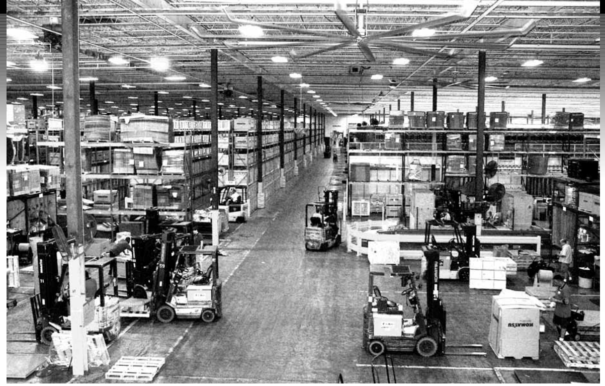
Komatsu's Central Parts Operation in Ripley, Tenn., is open 24 hours a day, seven days a week and is the main hub that handles parts distribution for Komatsu distributors and their construction and mining customers throughout the world. Komatsu also has eight regional parts distribution centers across North America.