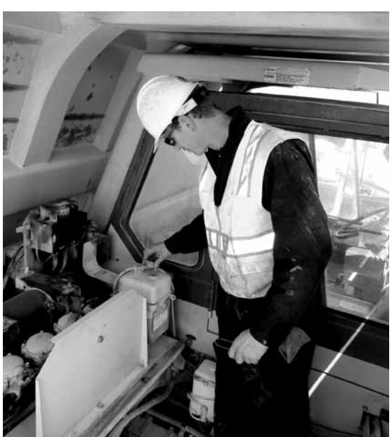
Extensive training helps Komatsu distributor technicians quickly diagnose and fix issues, as well as provide scheduled maintenance, such as fluid and filter changes.