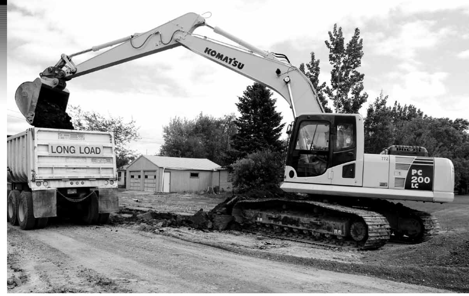
There's a push to use less virgin material and more recycled material in new-road construction. The Greenroads Foundation developed a rating system for Greenroads certification, much like LEED certification for buildings.

ago. The Center's mission is to "... develop and distribute technology needed to use recycled materials in the transportation infrastructure in a cost-effective and environmentally sound manner." The Center has conducted more than 60 research projects, with a major focus on reducing the more than 4.5 billion tons of waste generated annually in the United States.