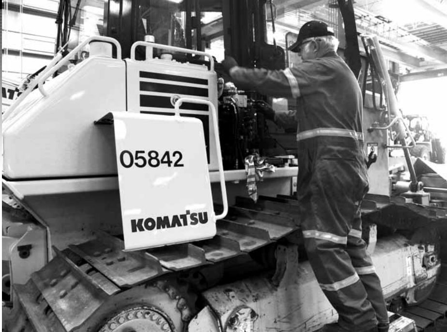
Komatsu technicians are skilled in working on all types of machinery, from tight-tail-swing excavators to the largest mining equipment.

ANSWER: Similar to our product lines, we're always striving to improve service. Expanding the Komatsu CARE program is one area on which we're working. Giving customers a menu of options to choose from when it comes to maintenance is also something we're pursuing.