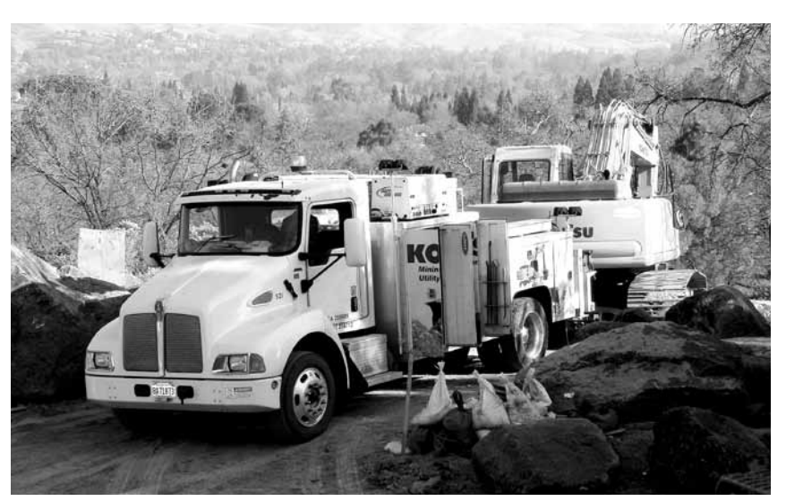
Innovations such as KOMTRAX allow Komatsu and its distributors to track machines and schedule on-site service at a time and location convenient to the customer.