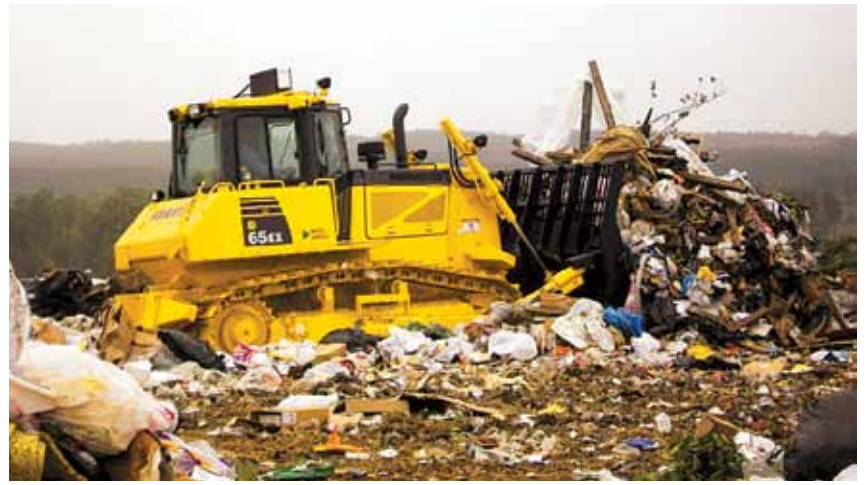
Komatsu's D65-17 waste-handler dozers are purpose-built with added guarding for working in tough conditions such as landfills. Blade options include SIGMA, power-angle-tilt and straight-tilt to match the user's need and maximize productivity.

"We know that many waste-handling operations work around the clock, so we kept the cab-mounted lights and moved the hood-mounted work lights to the top of the blade cylinders. Then, we placed an additional work light on each cylinder, for better night visibility," Boebel pointed out. "These productive features, when combined with our more efficient Tier 4 Interim engines, move more trash at a lower cost. We further reduced costs by offering complimentary scheduled maintenance through our Komatsu CARE program for the first three years or 2,000 hours, whichever comes first."