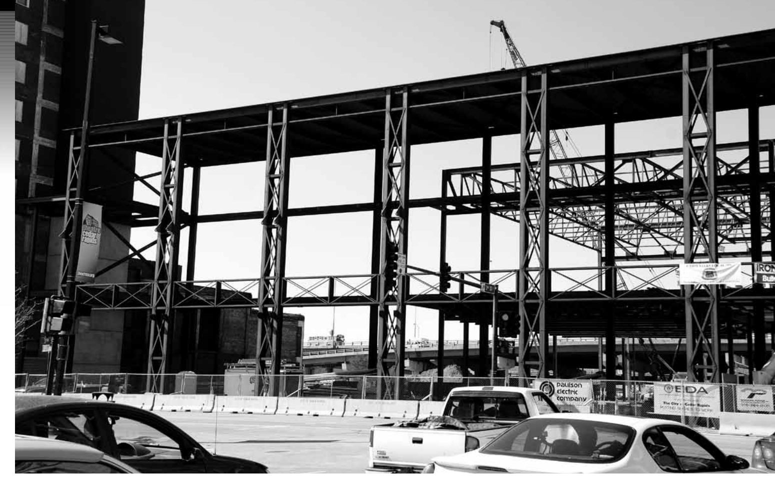
The latest buzz in the construction industry is the use of Building Information Modeling, or BIM, which follows a building's "history" from initial planning through its entire life cycle, including eventual demolition. All aspects are factored in, making a model plan of the building to create better efficiency and job costing.

replacing the older, by-hand methods. However, in the past few years, there's been a trend that allows companies to take site-grading plans in digital format and plug them directly into a telematics device on a machine.