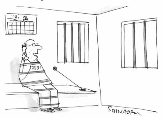
"Yes, I would like to take you up on your offer of easy-to-open replacement windows."