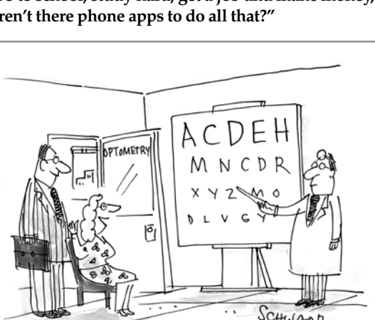
"My lawyer will read the fine print."

"Go to school, study hard, get a job and make money, aren't there phone apps to do all that?"