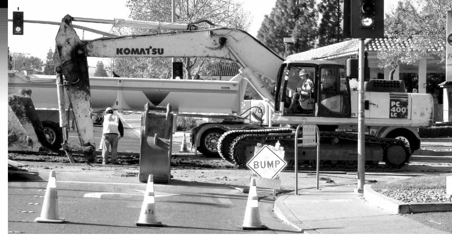
The American Society of Civil Engineers says improving the nation's infrastructure would improve the economy by making us more efficient and putting construction workers back to work.

2012 appropriations are eventually finalized, they are virtually certain to contain diminished federal support for numerous programs."