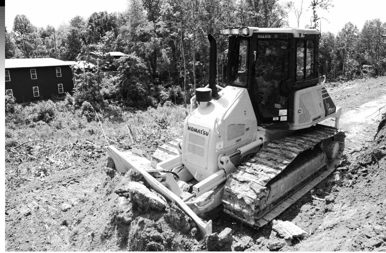
Before putting that blade to the dirt, you should have a pre-excavation meeting that covers a variety of important topics, such as staging of equipment, establishment of working hours and emergency contact information.

from one area to the next, or are located near critical or high-priority facilities. Such facilities include, but are not limited to, high-pressure gas, high-voltage electric, fiber-optic communication, and major pipe or water lines."