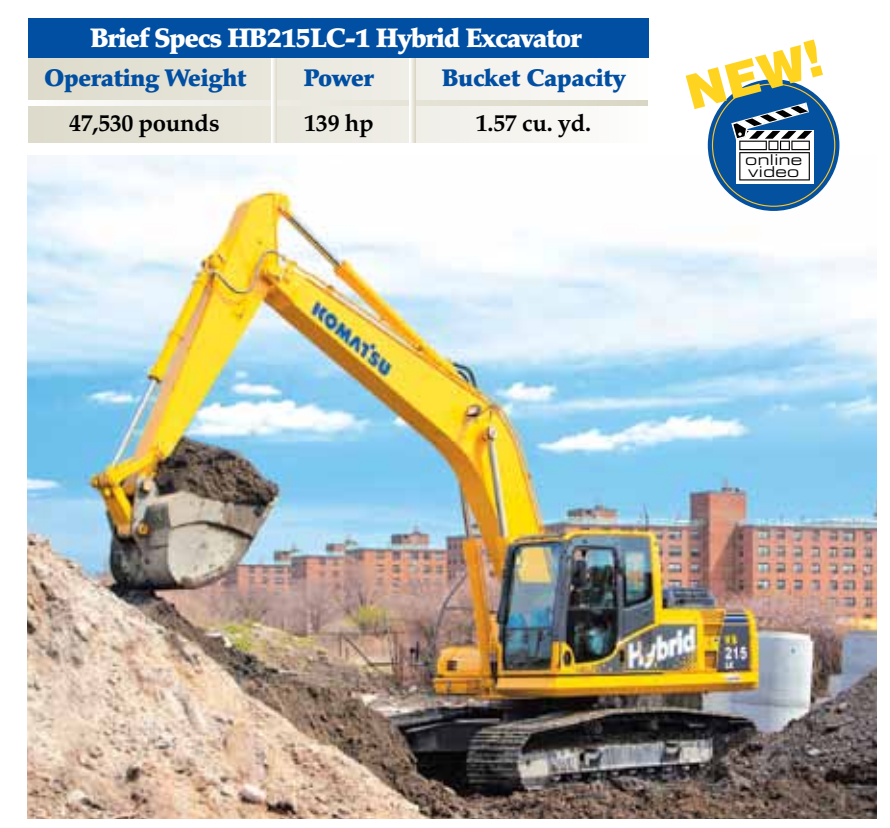
The HB215LC-1, Komatsu's second-generation hybrid hydraulic excavator, has a service valve to power attachments and is 25 percent more fuel-efficient than a similar-size conventional excavator.