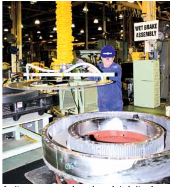
Quality components make up the truck, including the wet-disc brakes which are assembled at PMO.