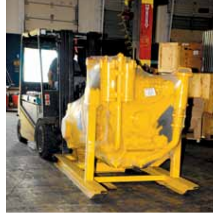
The Central Parts Operation carries thousands of items for Komatsu machines, from routine maintenance items to engines. It also carries remanufactured engine and transmission blocks and other large components.

Komatsu's Central Parts Operation is expanding with a 100,000-square-foot addition that's designed to improve efficiency. The CPO handles parts for Komatsu's construction, mining and utility equipment around the world, including both new and remanufactured components.