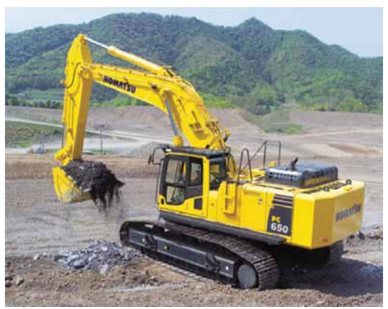
Significant improvements in comfort, control and performance make the new Komatsu PC650LC-8 a more productive excavator.