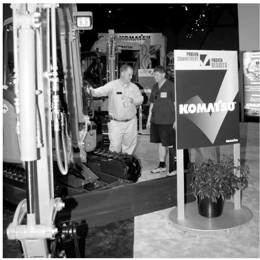
Product managers and other personnel will be on hand to provide information and answer questions about how Komatsu can help your business.

Past attendees enjoyed Komatsu's video simulators, so a six-person video game center will be part of the exhibit space at the upcoming expo. It features a Komatsu HM300 articulated truck in a race through a fictional construction site. A company store with items