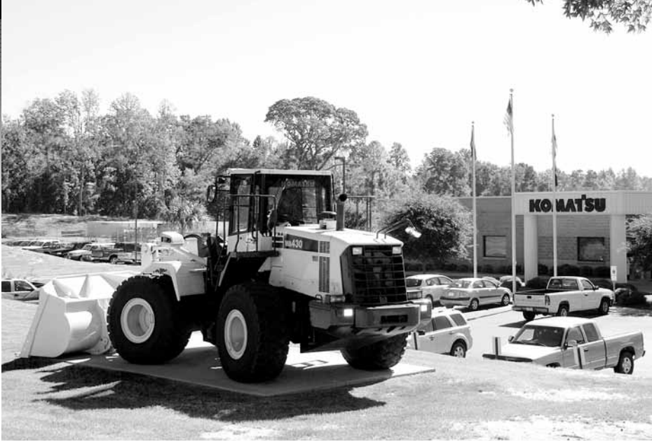
Komatsu's Newberry Manufacturing Operation produces six wheel-loader models, ranging from the 170-horsepower WA320-6 to the 350-horsepower WA500-6, as well as fork lifts.

The plant is 250,000 square feet of building sitting on 80 acres of land, and was built with future expansion in mind. I'm sure at some point that will be a consideration.