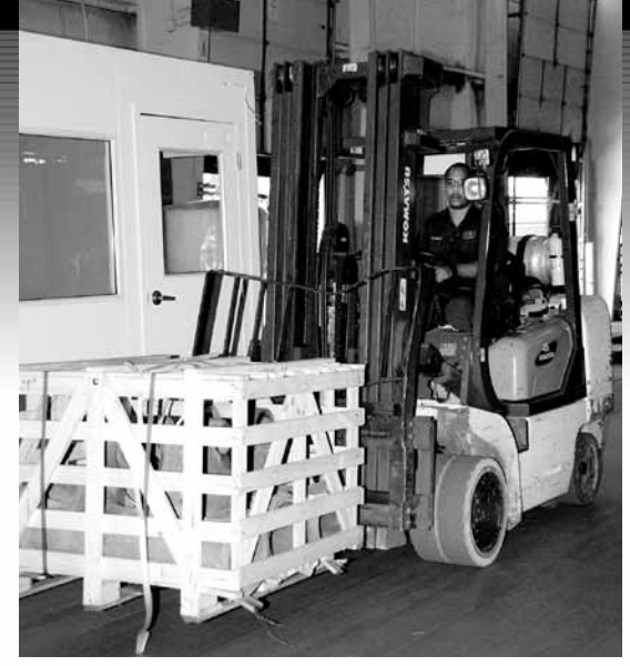
Larger parts are moved around the NMO using Komatsu fork lifts, which are also produced the plant.

shows that we're a facility focused on using environmentally sound practices.