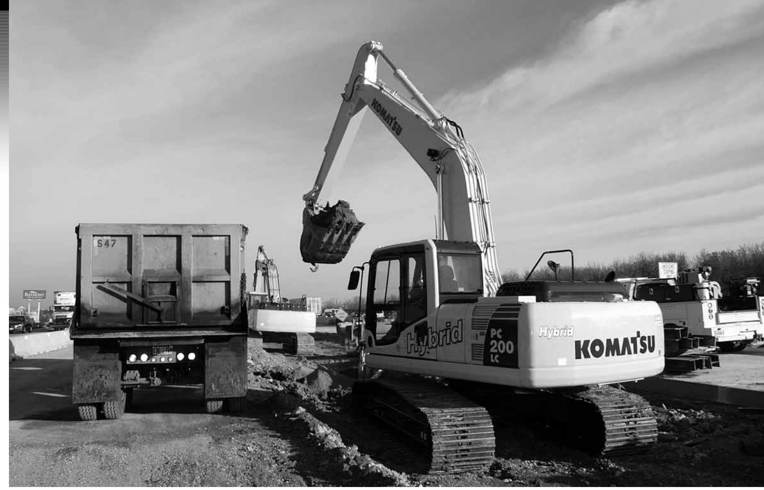
Komatsu will highlight its Hybrid PC200LC-8 excavator, as well as new equipment with Interim Tier 4 engine technology that goes into effect at the beginning of next year.

Also new in 2011 is an enhanced Safety Zone with an innovations theater and simulators that feature exhibits and demonstrations from industry and government groups, including OSHA, MSHA and others.