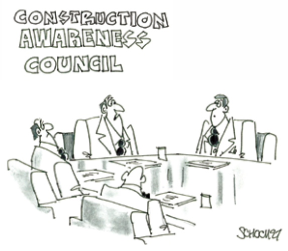
"Really? I wasn't aware of that!"