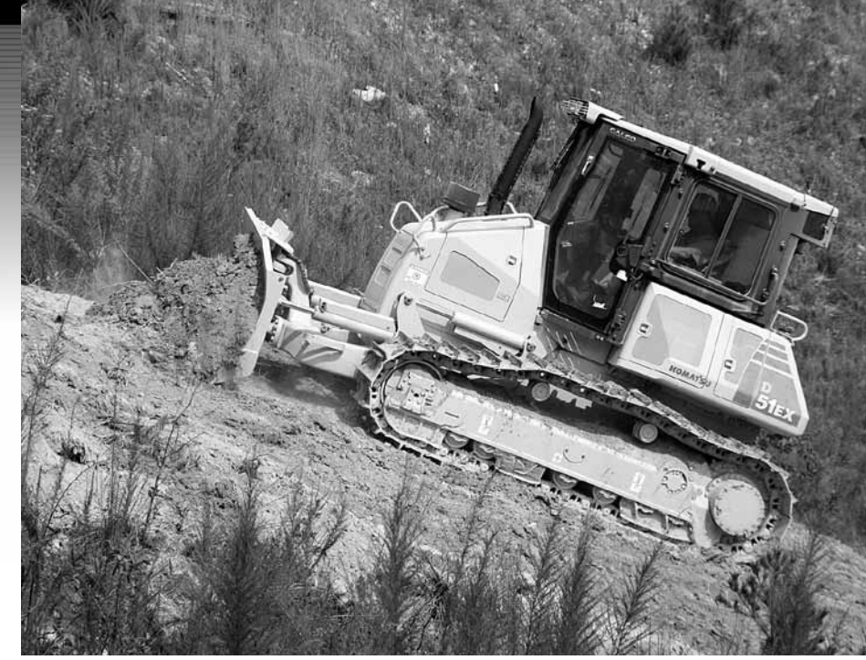
The D51 dozer with its cab-forward and Super Slant nose design is a result of input from customers who wanted increased productivity and improved visibility.

ANSWER: It depends on the machine, but there are always several individuals working on research and development of a product. We have about 130 people in R&D, but of course they aren't the only ones involved. We work with engineering and manufacturing to