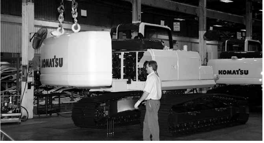
Komatsu's North American operations include three manufacturing plants in the United States that supply not only North America but also some products globally.