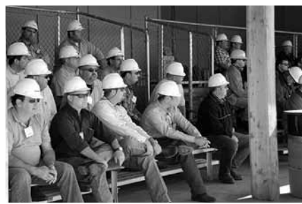
Demo Days attendees listen to a brief presentation at the Komatsu Training and Demonstration Center in Cartersville, Ga.