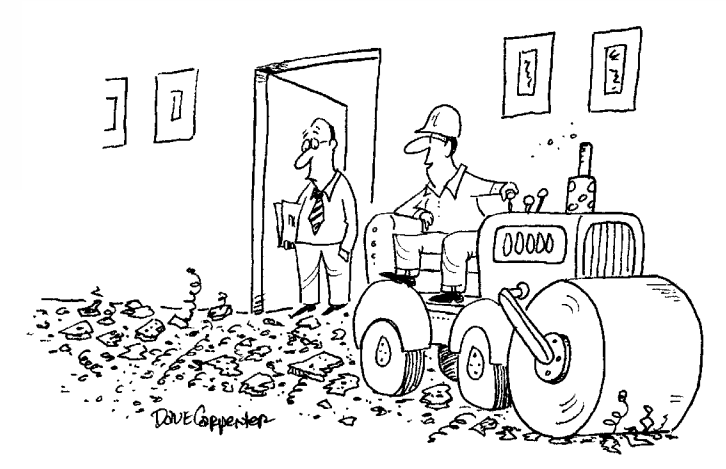
"That should take care of the virus in your office computers."