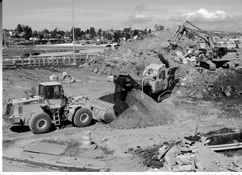
In the current economy where you're probably seeing more competitors submitting bids, a value-added service such as on-site crushing may allow you to be more cost-effective. By doing more for less, it will improve your odds, not just of winning the bid, but of making money on the job.

You'll also need to consider other technology and how it factors into the bid. If you use GPS-based systems in your equipment, it's