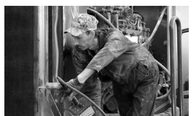
Komatsu service technicians are among the most highly trained in the equipment industry, receiving classroom and hands-on training from a variety of resources.