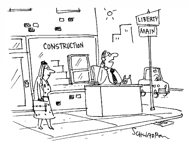
"It isn't exactly my idea of a corner office."