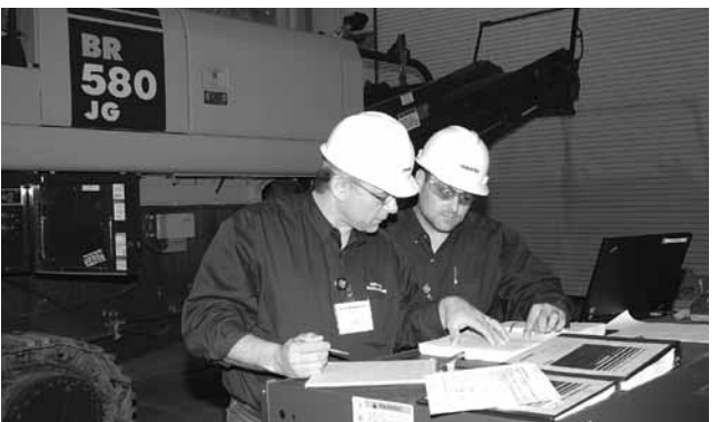
The annual Komatsu Advanced Technician Competition tests service personnel on their knowledge and ability to diagnose and fix potential equipment issues. It's one of many ways Komatsu puts a focus on quality, efficient service designed to minimize downtime.

would oftentimes respond to a service call and go in blind, so to speak. He'd spend time diagnosing a problem, and often have to return to the shop for parts to fix it. In addition to the technology we mentioned before, technicians now carry laptops that can access shop manuals for every new series of Komatsu machinery, and soon we'll have computerized manuals for machinery going back 20 years or more. If technicians are on the road and get a service call, they can look up the machine that's down and see what they need to fix it. If they need parts, they can swing into their distributor branch location and pick them up before going out on the jobsite. These are just a few examples that have grown out of listening to customers' input and implementing the necessary measures to ensure uptime and increased production.