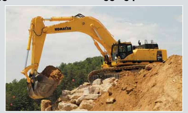
The PC800LC-8 Super Digger provides additional digging force to break through difficult materials more easily. For more information and to see a video, visit www.videocpi.com.

The Super Digger has a heavy-duty arm equipped with double-arm cylinders and a heavy-duty bucket cylinder, that work to increase the digging force, while maintaining the same working range and transportation dimensions as the standard machine. "Because the digging forces are substantially increased, the machine can break through difficult materials more easily," explained Doug Morris, Product Marketing Manager, Excavators. "Typically,