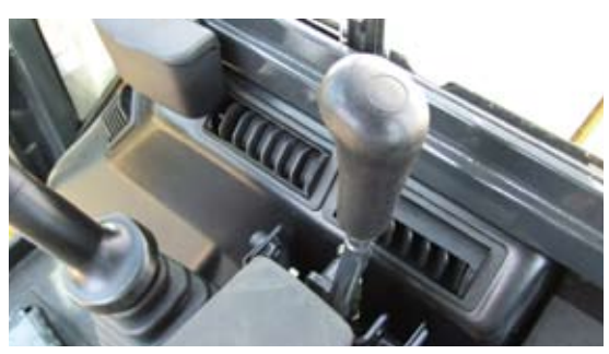
Ease of use was built into the MR-3 series with a new dozer control lever that has two-speed travel control, as well as auto shift and load sensing.