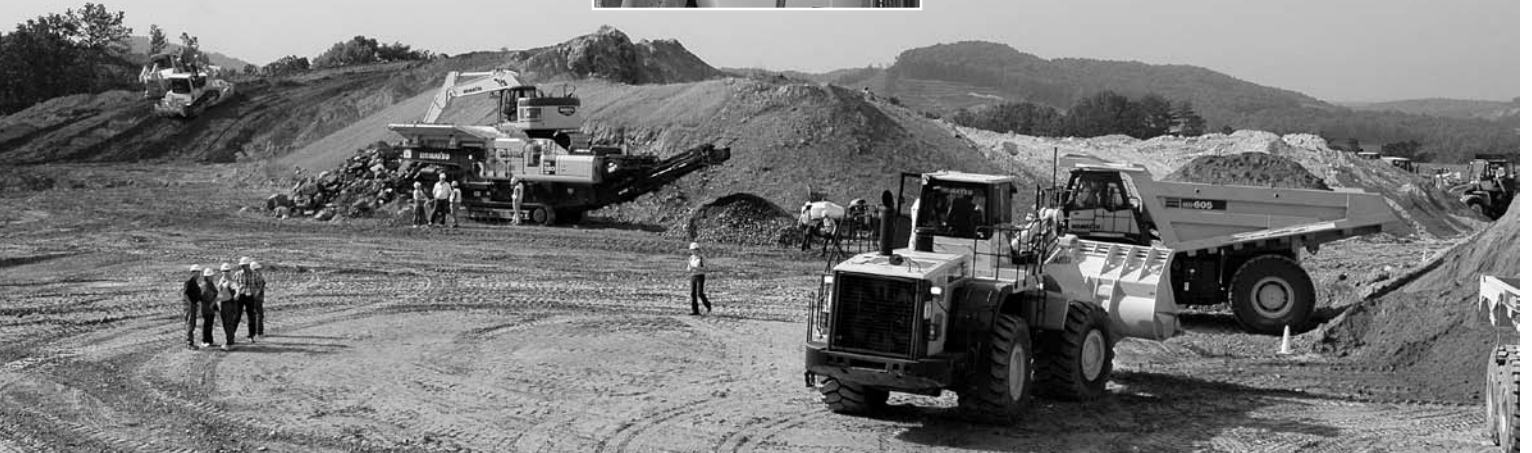
At Demo Days, equipment users get the opportunity to see and operate new and updated Komatsu machines.

For more information on any of these units, feel free to call your sales representative or visit our nearest branch location. In many cases, if you'd like to try something out, we'll be able to set up a demo for you. ■