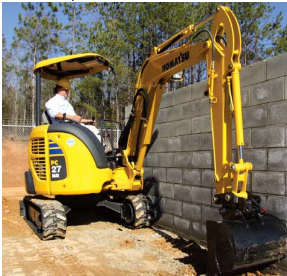
The new MR-3 series of compact excavators ranges in size from the 4,090-pound PC18MR-3 to the 11,376-pound PC55MR-3.