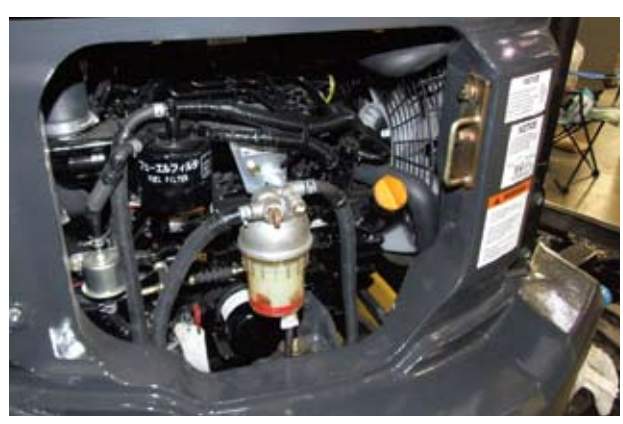
Komatsu's new MR-3 series of compact excavators features ease of maintenance with larger, lockable access covers for accessing the engine, hydraulics and fuel, as well as for cleaning coolers.