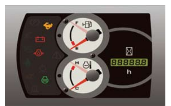
A new monitor panel has easy-to-read gauges and warning lights, hour meter, charge-level monitor with audible alarm, engine oil-pressure monitor with audible alarms and high-speed travel indicator.