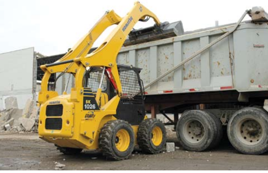
Komatsu's Newberry, S.C., manufacturing facility is the worldwide development center for skid steer loaders. Komatsu will introduce its next-generation, Tier 3-compliant skid steers later this year.

ANSWER : Like much of Komatsu's larger construction equipment, utility machines