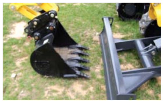
Komatsu improved functionality with the MR-3 series, including a reduced gap between the blade and bucket for easier load-and-carry.