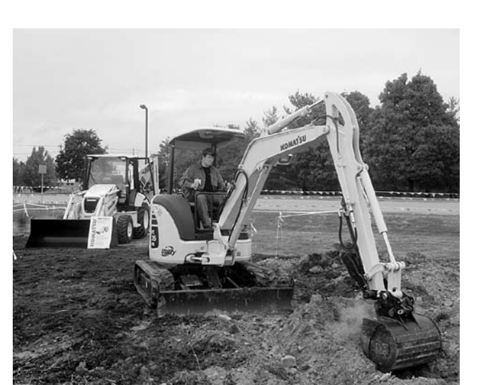
ICUEE attendees had the chance to try the latest in utility equipment, including Komatsu's PC35MR-2 excavator.