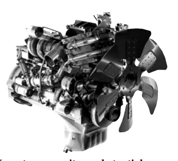
Komatsu commits a substantial amount of its annual sales to research and development, which allows it to remain a technological leader, producing advancements like the ecot3 engine.