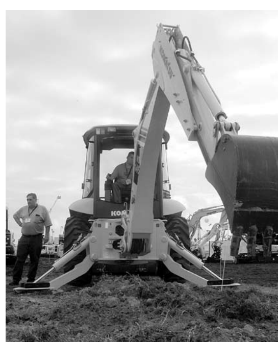
One of the benefits of ICUEE is the opportunity for attendees to demonstrate equipment, such as Komatsu's WB146-5 backhoe loader. Also available at the show was the WB146PS-5, which features power shift.