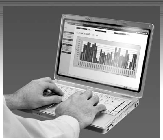
With the KOMTRAX machine-monitoring system, which is installed on virtually all Tier 3 Komatsu machines, contractors can track their equipment's performance from a laptop or office computer.

ANSWER: We believe our KOMTRAX machine-monitoring system is tremendously beneficial for our customers and will go a long way toward cementing a relationship. The KOMTRAX system provides the customer with information, including location, service-meter readings and fuel efficiency reports. With the customer's approval, his Komatsu distributor also has access to the information and can use it to take care of basic maintenance services, track machine performance and offer advice regarding possible repairs or component replacements that will save money, lessen downtime and improve performance over the long term.