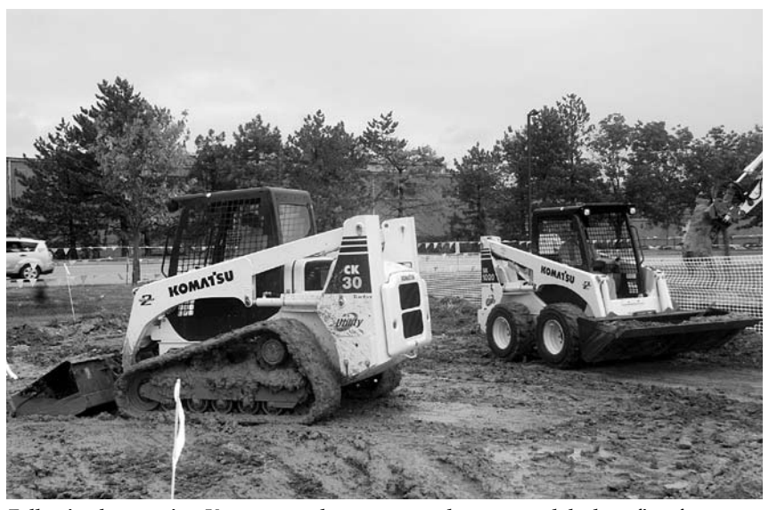
Following heavy rains, Komatsu product managers demonstrated the benefits of Komatsu's skid steer and compact track loaders by moving dirt in the display area.

to tilt up the ROPS structure as well. Now they have full access to the hydraulic components, the swing motor and the backside of the engine where the alternator and starter are located."