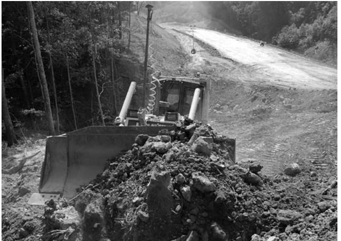
Public construction, such as road building (left), and commercial construction (above) continued to show growth in 2007 with solid increases expected to continue this year as well.

Underscoring the idea that housing is more of a local and regional problem than it is a national one, NAHB reports that a majority of markets (200 of 363) continue to experience "modest and sustainable" appreciation in house values, adding, "The fallout from irresponsible subprime ARM lending will not include deep, nationwide house price declines."