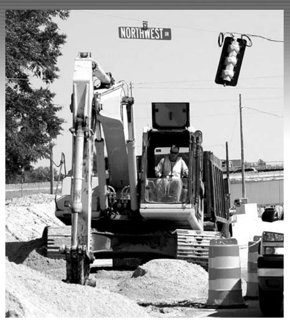
The highway bill Congress passed last year will spur roadrelated construction activity.