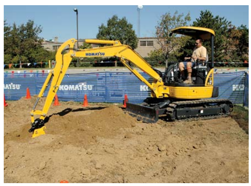
This attendee tried out the Komatsu PC35MR-2 compact hydraulic excavator at the ICUEE show.

The SK1020 skid steer loader (right) and WB140 backhoe loader (below) were two machines Komatsu had available for demonstration at the event.