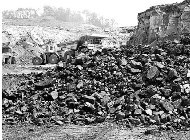
Both mining and logging should do well in 2006, however, there will likely continue to be a shortage of some large equipment, so if you anticipate needing a mining machine or large truck, forecasters recommend ordering early.

markets, where speculation has occurred. Anybody who is speculating on housing in any of these red-hot areas, hoping to become rich through real estate, could be in for a shock. While a few may time their exit just right, I expect most of those speculators to become much poorer, but smarter. For most of us, the bigger housing-related problem is that when the bubble does burst in these overheated regions, it will make great headlines and cause some uncertainty in local markets throughout the country.