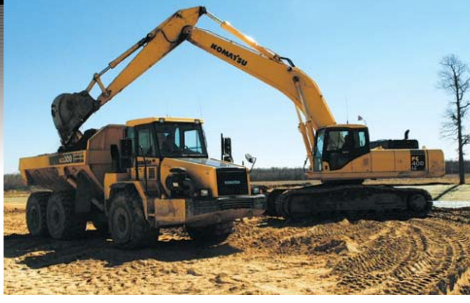
As the excavator/articulated dump truck combination gained widespread acceptance in the last decade or so as a cost-effective method of moving dirt, Komatsu introduced a highly regarded line of articulated haulers.

"When Komatsu came out with the first tighttail-swing machine in the mid- to late '90s, the old PC128UU that was painted purple, people