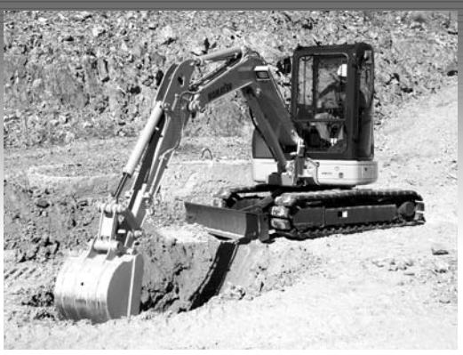
Mini hydraulic excavators are the fastest-growing segment of the utility equipment industry. Komatsu expects to be number one in this important machine group in the near future.

We didn't get into the business to be a bit player. We want to be one of the stars. In four years, we've gone from $47 million in sales to more than $200 million. In 2005 we increased our final deliveries by 33-percent versus year-to-date December 2004. Our goal is to be the numbertwo overall supplier of compact equipment, and number one in mini excavators, by 2007—and we believe we're well on our way to accomplishing that.